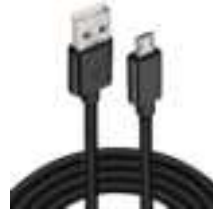
Buddi Mini +