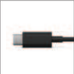
USB Charging Cable