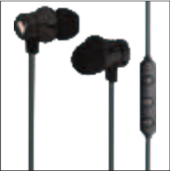
Bluetooth Wireless Earbuds