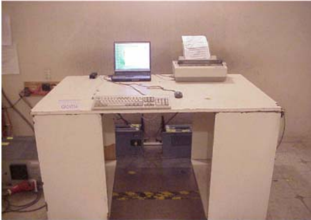
BACK VIEW OF CONDUCTED TEST