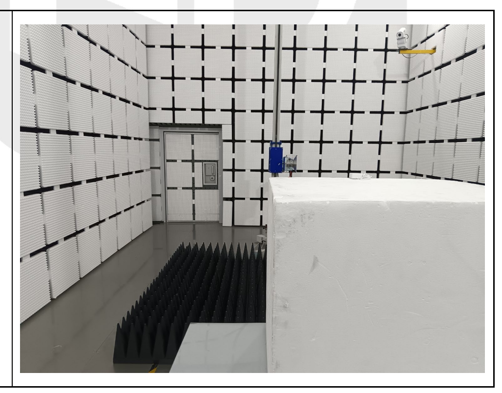
--- End ---