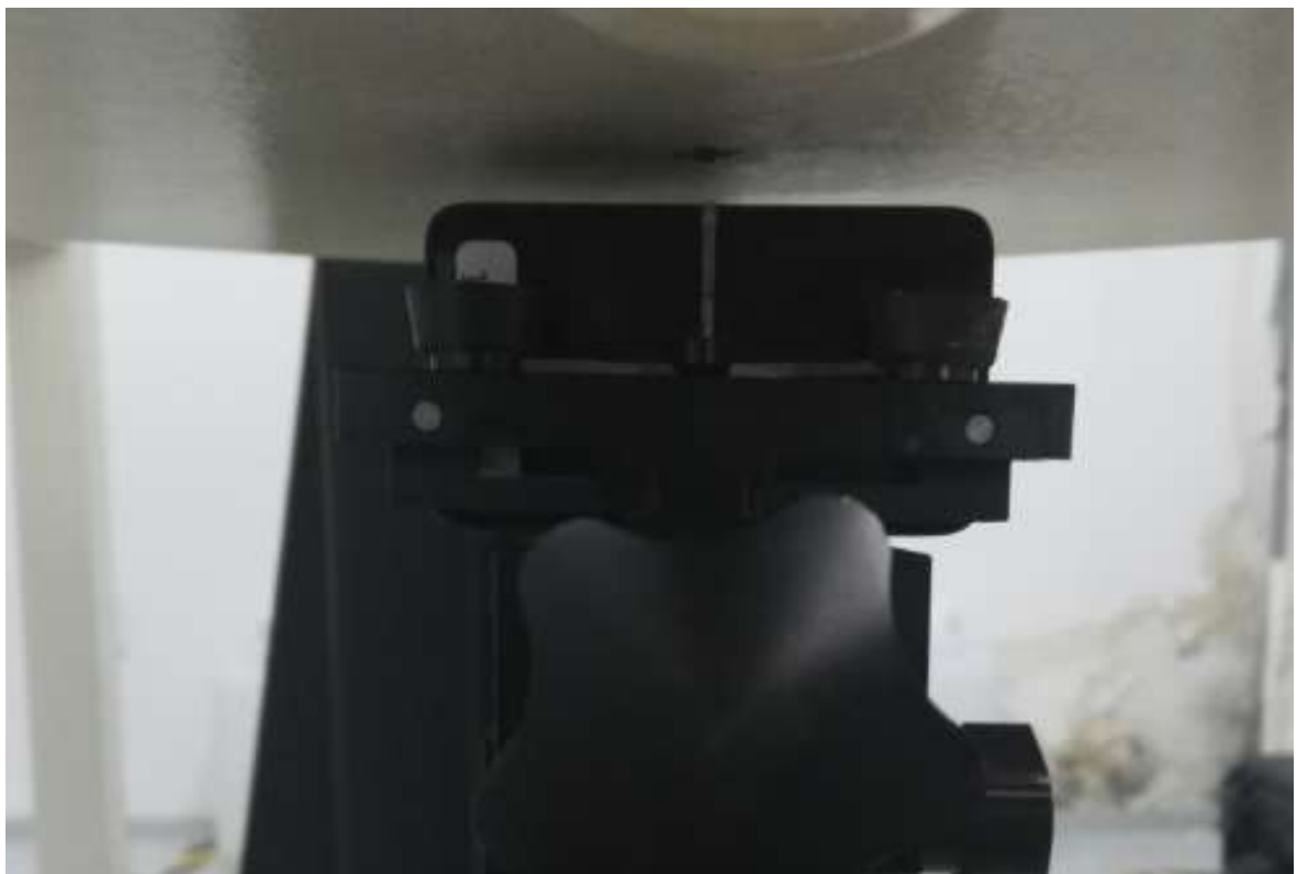
POSITION OF BODY right side 5mm DISTANCE