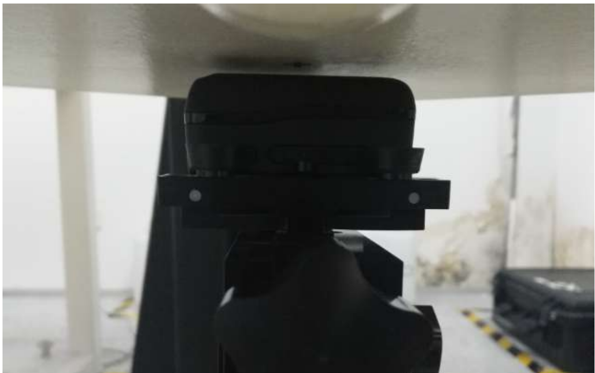
POSITION OF BODY TOWARDS GROUND WITH 5mm DISTANCE