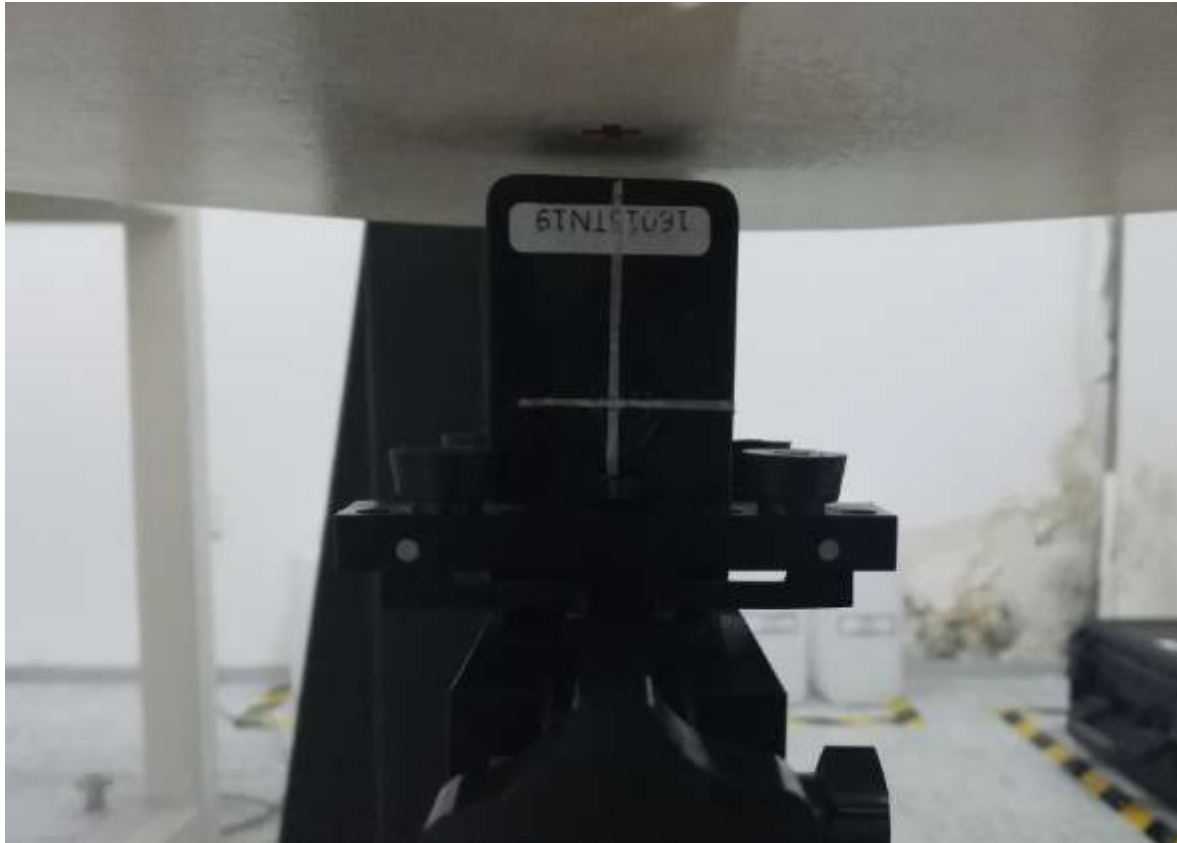
POSITION OF BODY back WITH 5mm DISTANCE