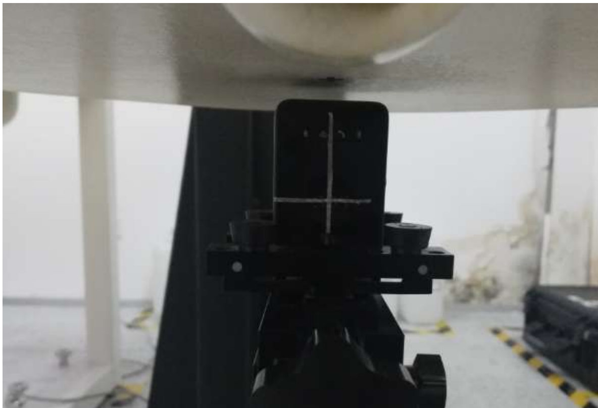
POSITION OF BODY front WITH 5mm DISTANCE