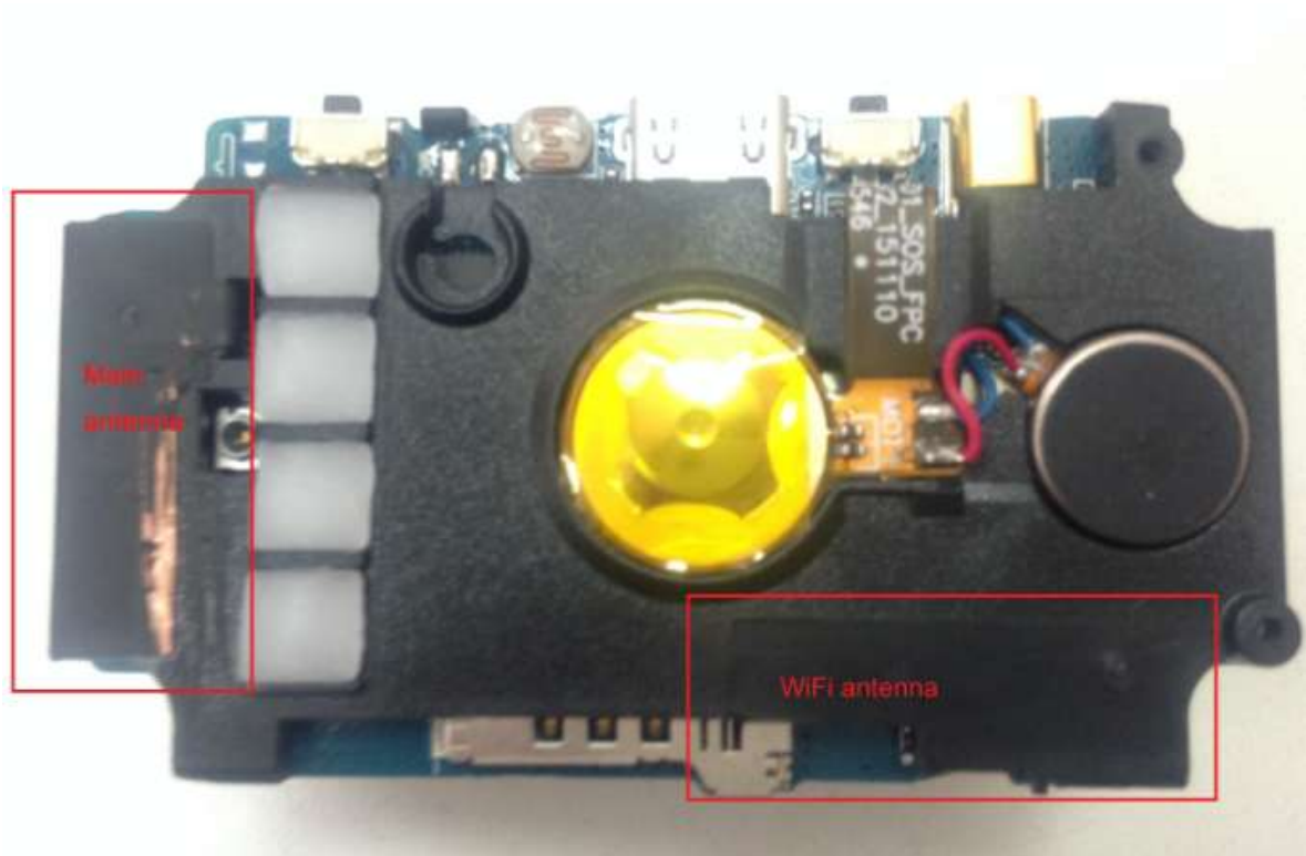
Picture of DUT's antenna