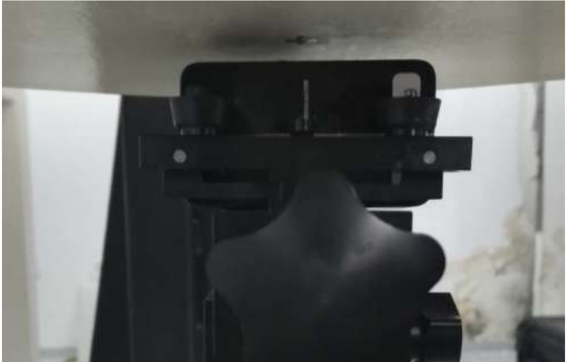
POSITION OF BODY left side WITH 5mm DISTANCE