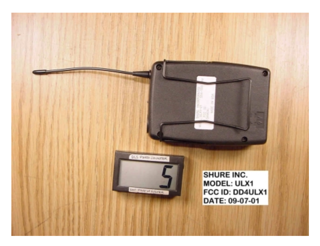
REAR OF EUT