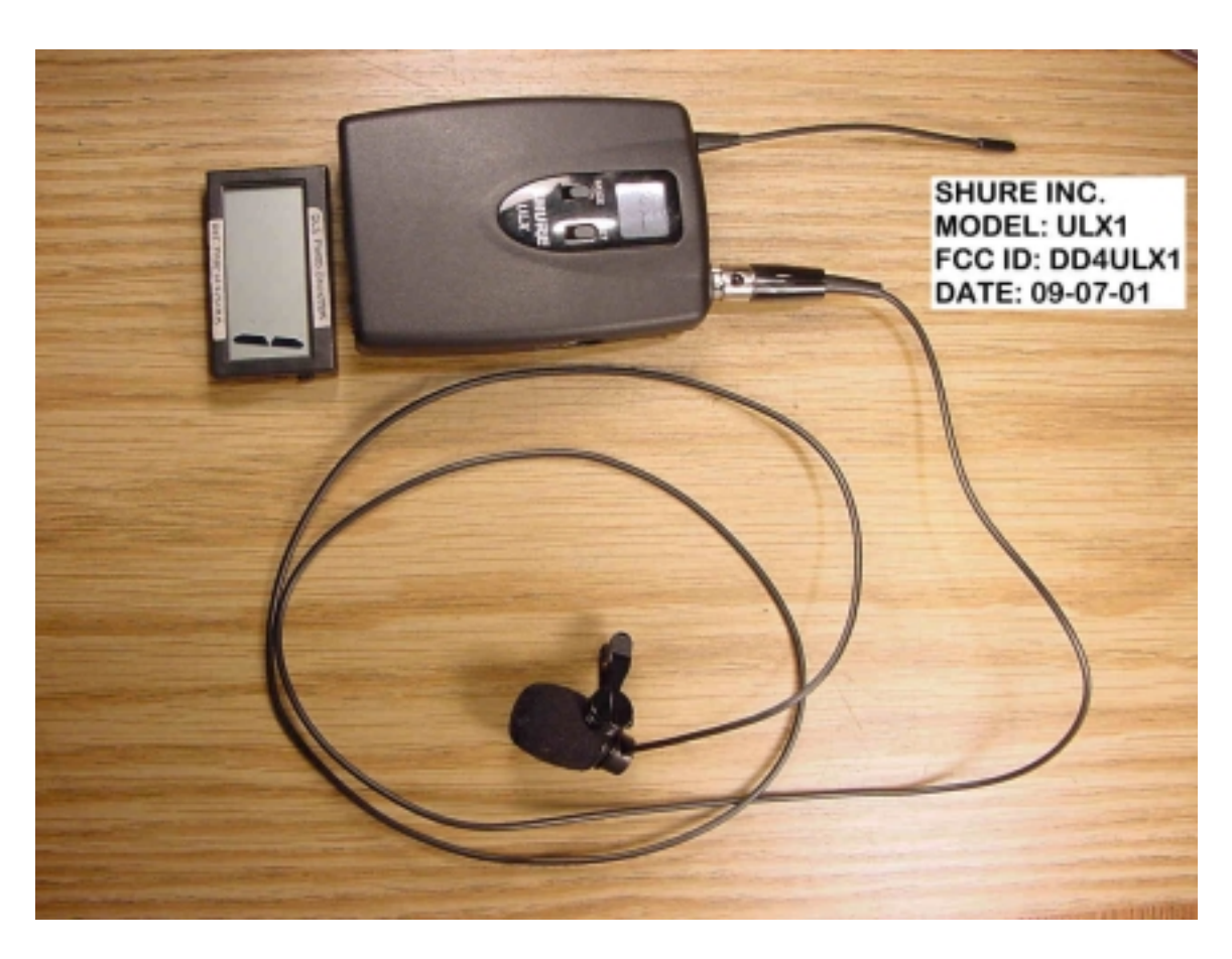
FRONT OF EUT