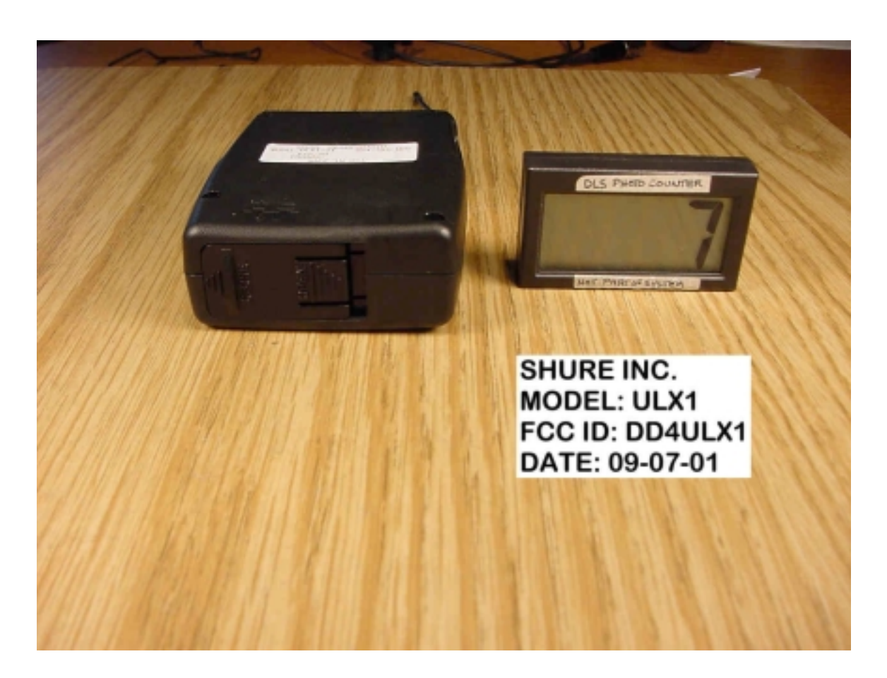
BOTTOM OF EUT