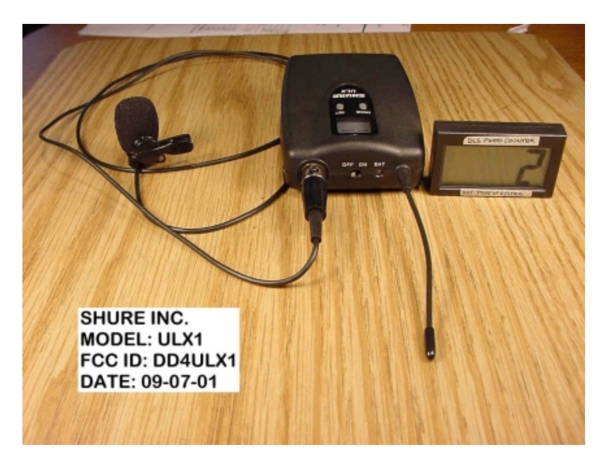
TOP OF EUT