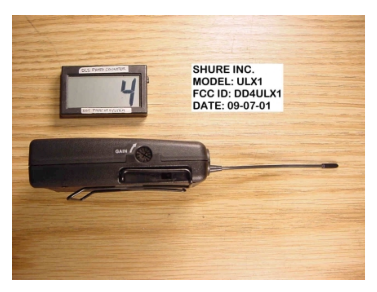
RIGHT SIDE OF EUT