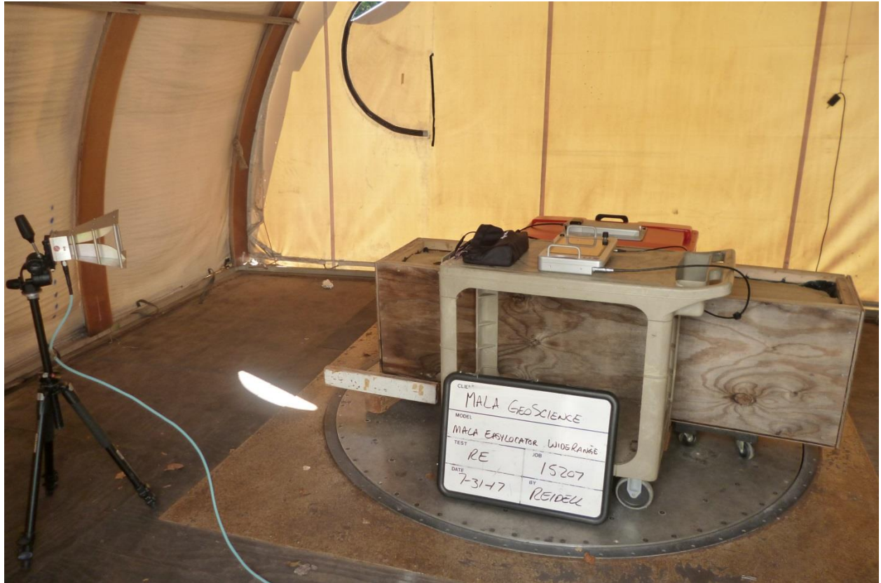
RE High Frequency