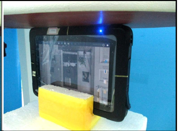
Bottom Side of EUT with 0 cm Gap