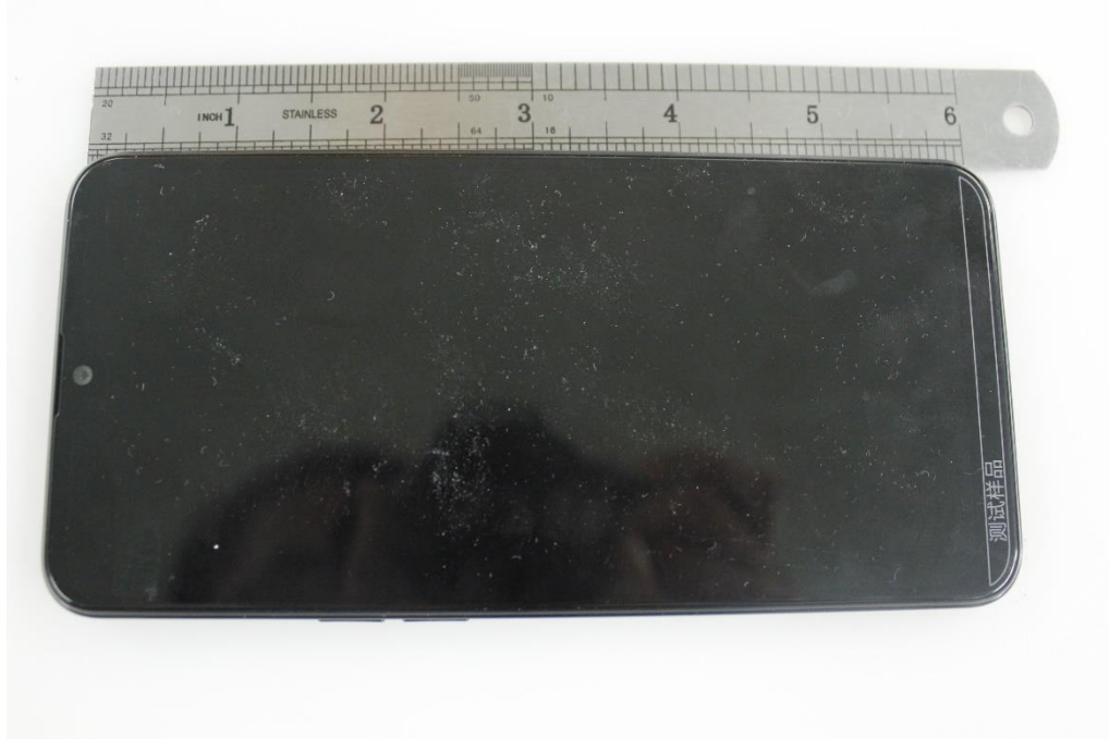
Picture - 1 Constituents of the sample