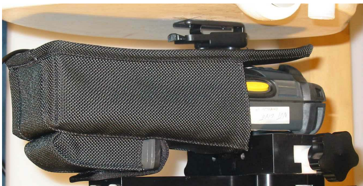
Figure 9 – MC9063 Screen Out Extra Battery