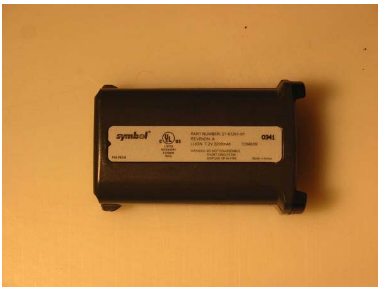
Figure 5 – Battery