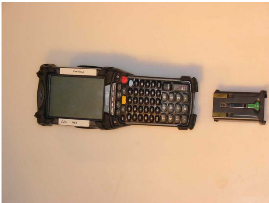
Figure 4 – MC9063 with Battery Removed

Symbol Technologies, Model No: MC9063 FCC ID: H9PMC9003B