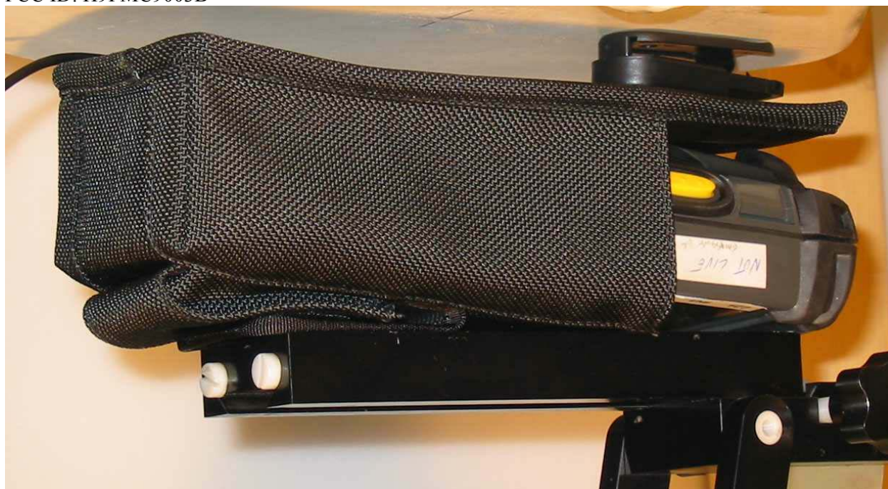
Figure 8 – MC9063 Screen Out

Symbol Technologies, Model No: MC9063 FCC ID: H9PMC9003B