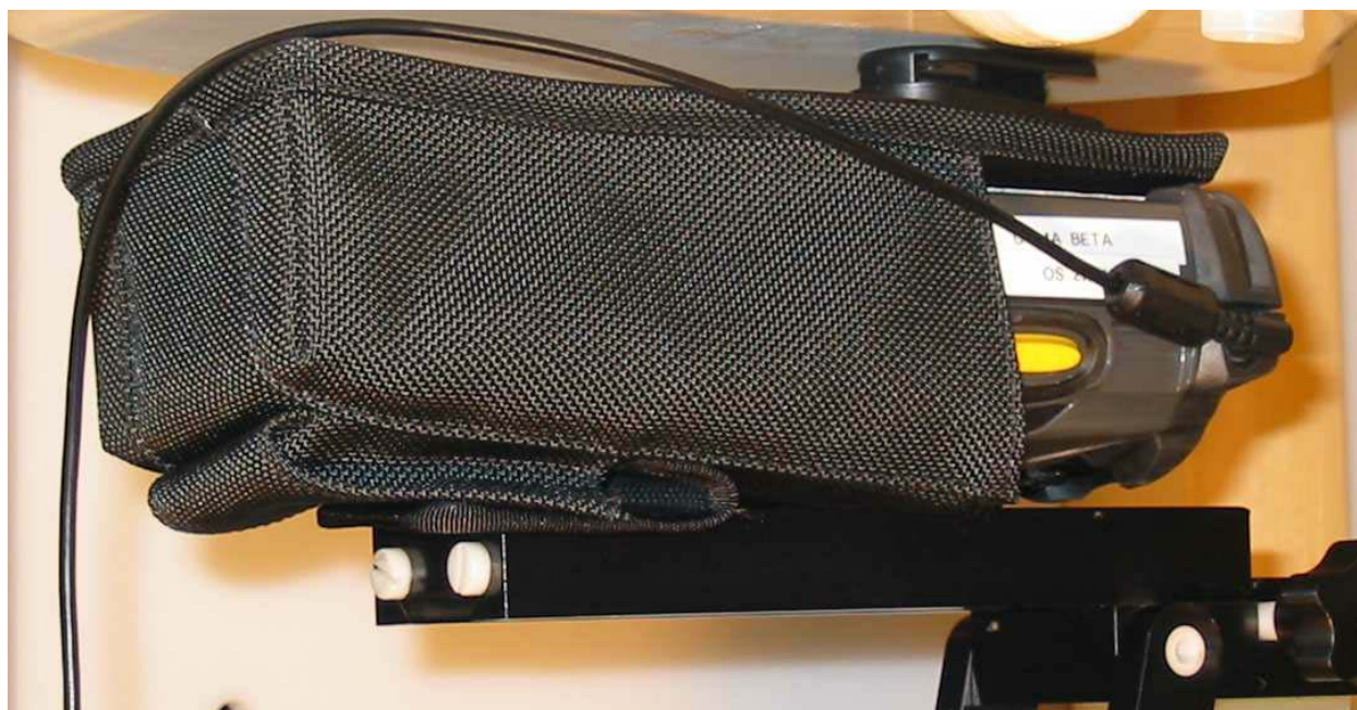
Figure 6 – MC9063 Screen In