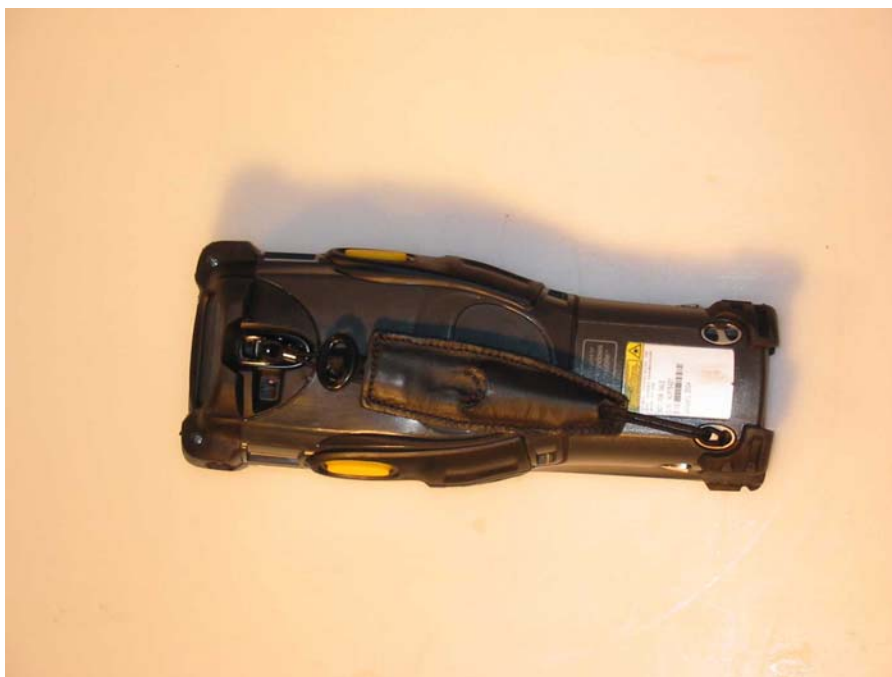
Figure 3 – MC9063 (Back)