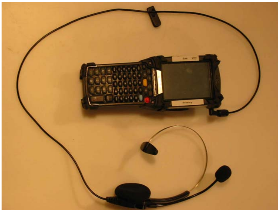
Figure 2 – MC9063 (Front) with headphones