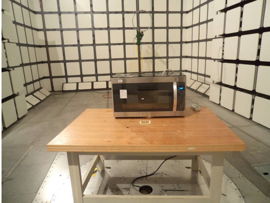
Radiated Emissions - Rear View (9 kHz – 30 MHz)