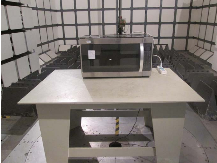
Radiated Emissions - Rear View (Above 1 GHz)