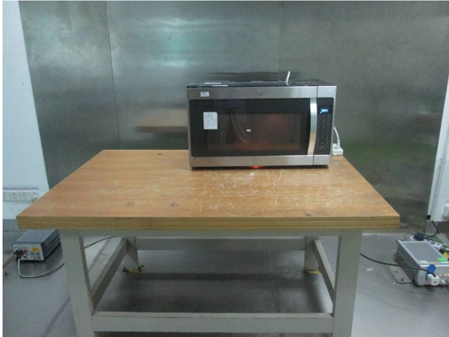
Conducted Emissions - Side View