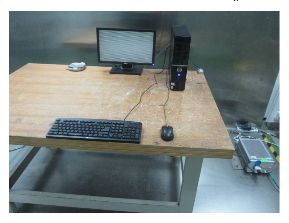
Conducted Emissions - Side View for Downloading mode

Conducted Emissions - Front View for Downloading mode