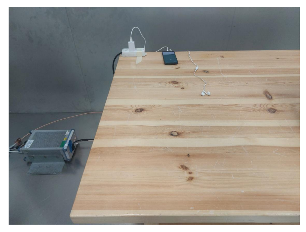
Conducted Measurement Photos