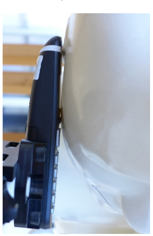
Pic. 5: Cheek position, right side.