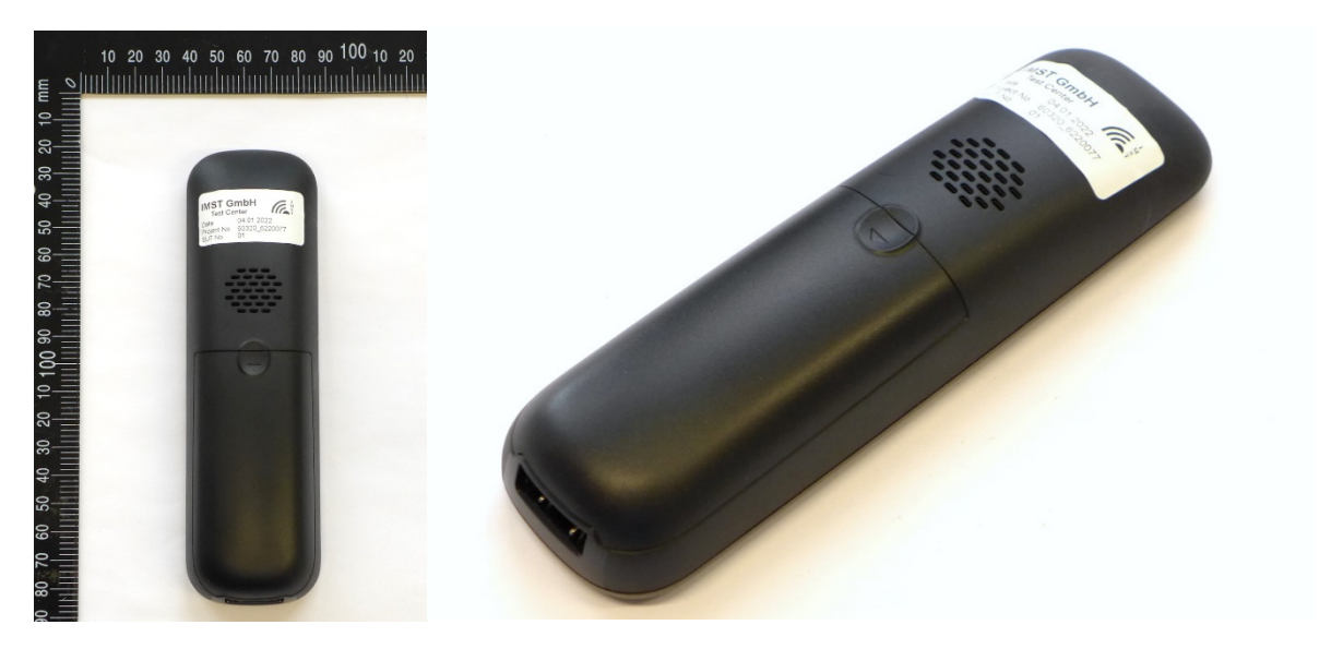
Pic. 2: Rear side views of the device under test.