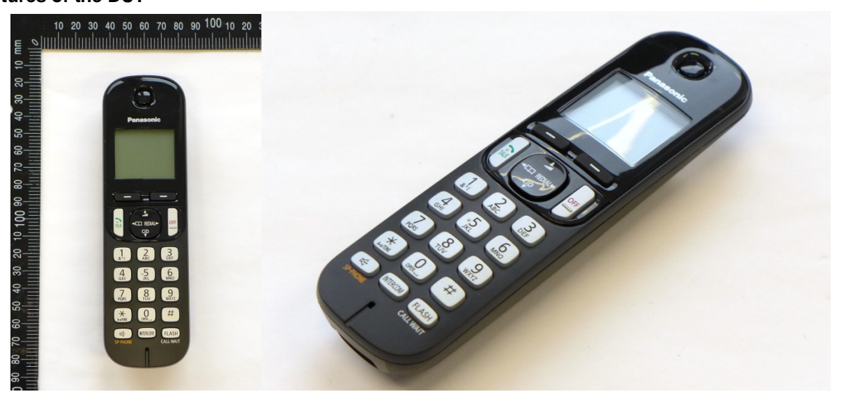
Pic.1: Front side views of the device under test.