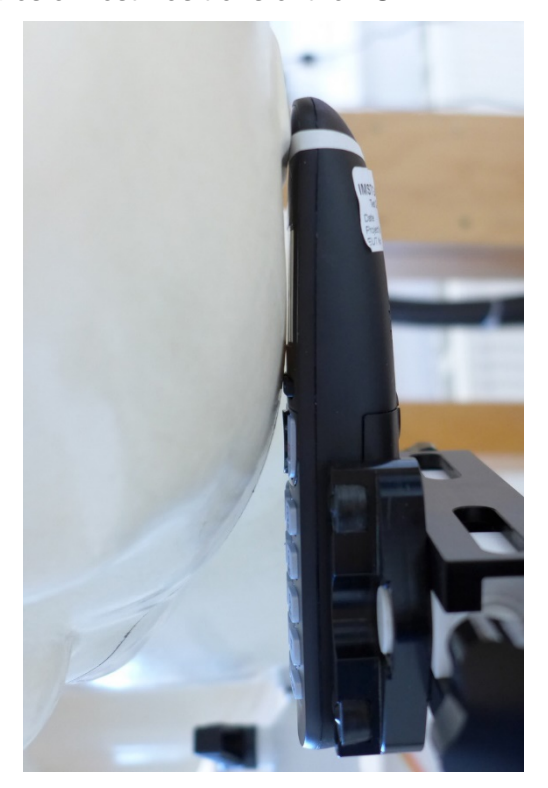
Pic. 3: Cheek position, left side.