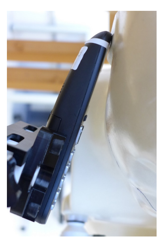
Pic. 6: Tilted position, right side.