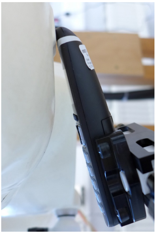
Pic. 4: Tilted position, left side.