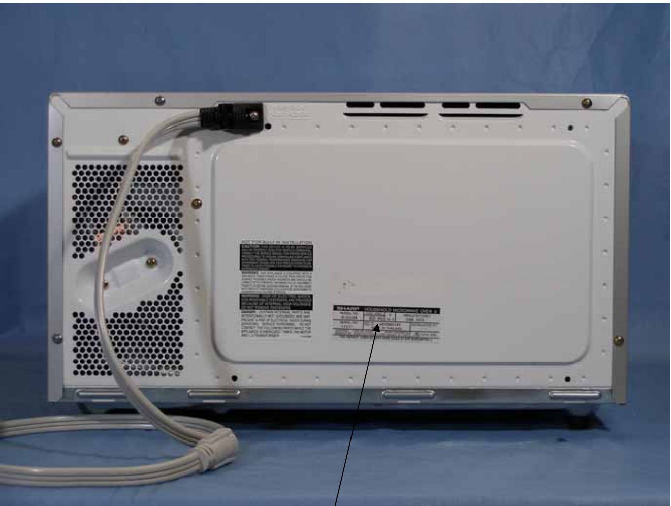
Identification Label (Nameplate)

ⓘ : Manufacturer identification marking for Sharp Appliances (Thailand) Ltd.