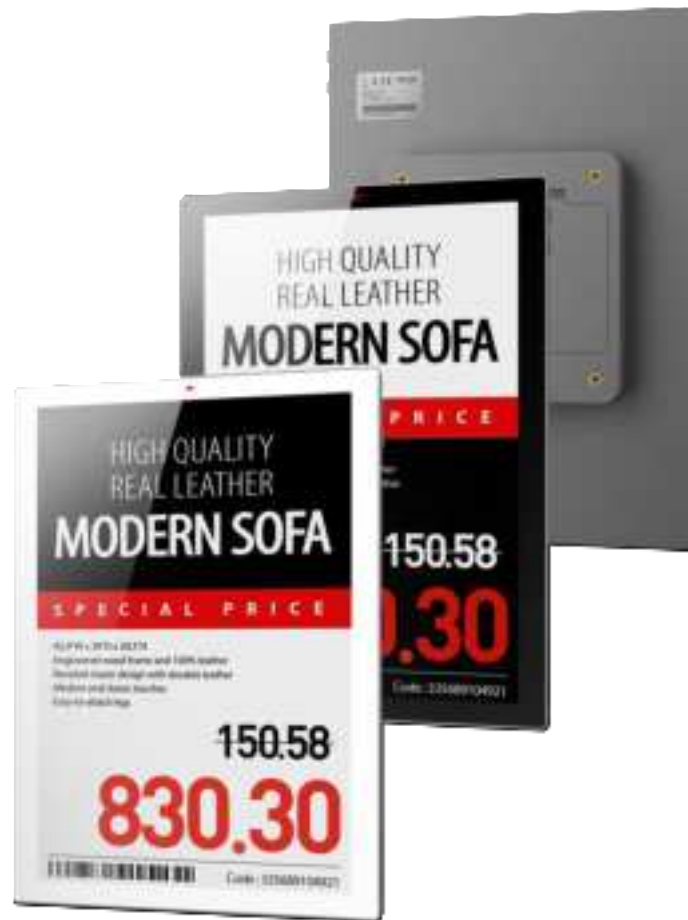
Figure 2. NEWTON S-Label