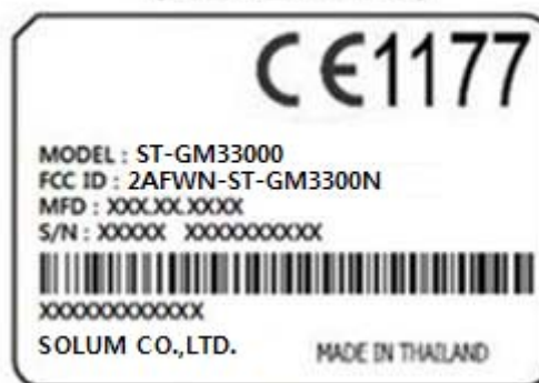
Product Label (Back, 35 X 25mm)