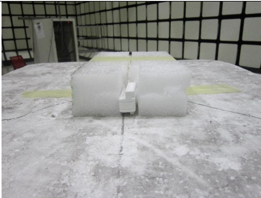
1GHz – 25GHz closeup