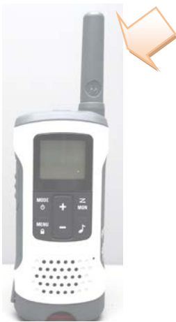
The arrow pointing to fixed antenna