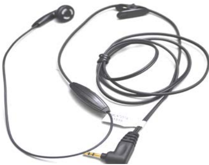
PMLN7251A Ear bud with PTT Microphone