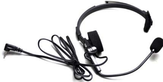
53725B Headset w/Swivel Boom Microphone