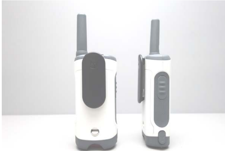
1564028V01(Side and Back view)