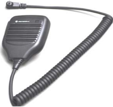
53724B Remote Speaker Microphone