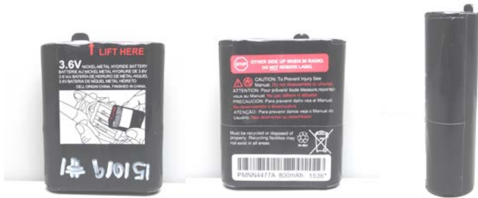
PMNN4477A 3xAA NiMH rechargeable battery pack (front, back and side view)