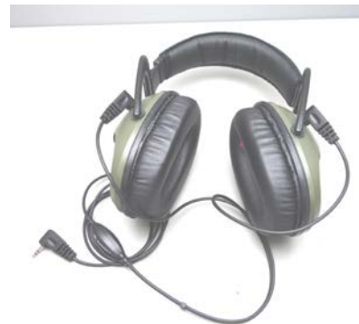
GU6970A Electronic Earmuff