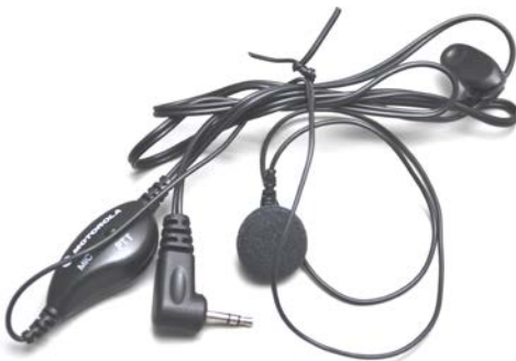
53727B Ear bud W/Push-to-Talk Microphone