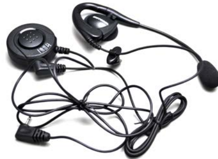
GU7140A Wired PTT button + 56320B Earpiece with Boom Microphone Bundle