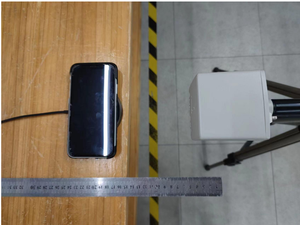
Test Position D-15cm from the edge of EUT to the geometric center of the probe