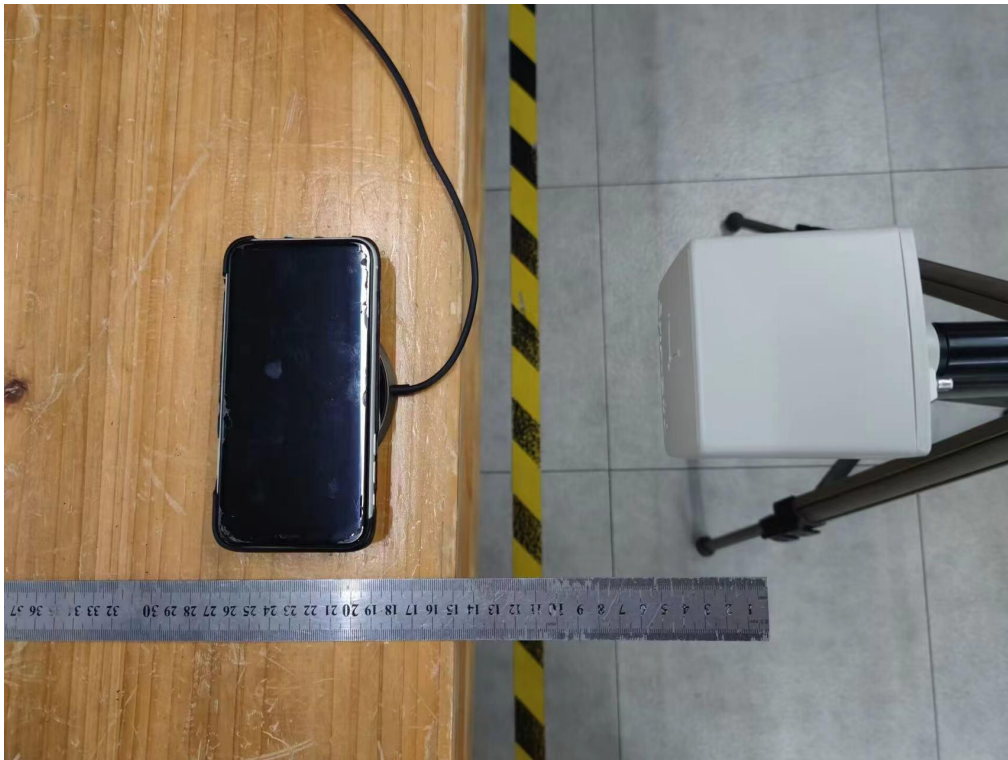
Test Position C-15cm from the edge of EUT to the geometric center of the probe