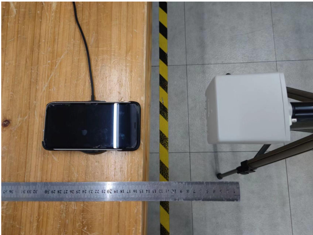
Test Position B-15cm from the edge of EUT to the geometric center of the probe