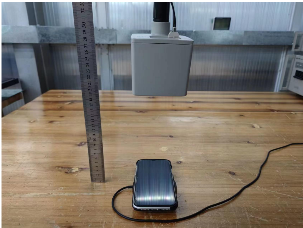
Test Position E-20cm from the edge of EUT to the geometric center of the probe