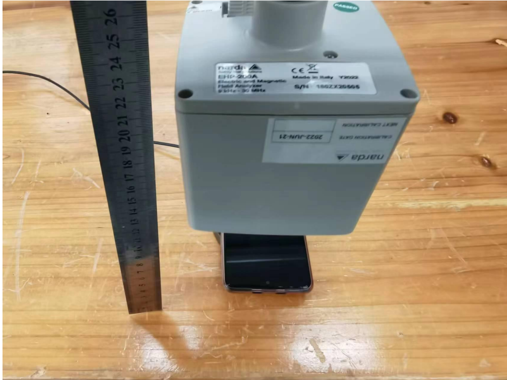
Test Position E-15cm from the edge of EUT to the geometric center of the probe