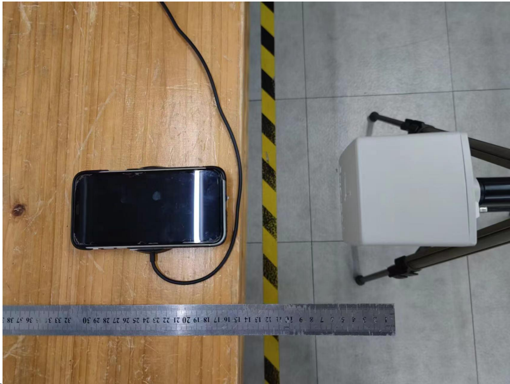
Test Position A-15cm from the edge of EUT to the geometric center of the probe