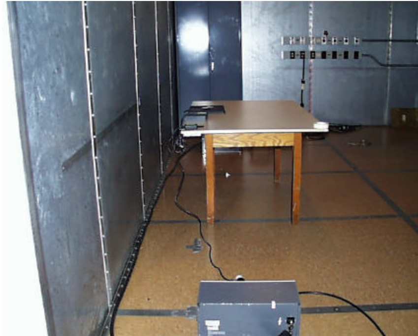
Photo 3 - Photo of Conducted Test Setup