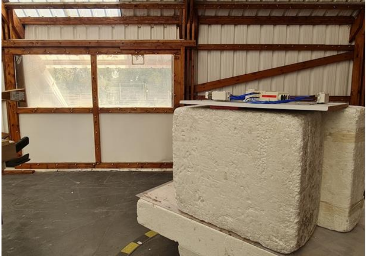
Photograph No.1 Peak output power, OBW measurement setup