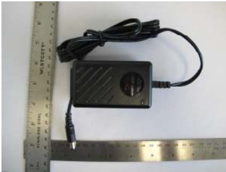
Figure 9 Model 3200 Programmer – Power Adapter (top)