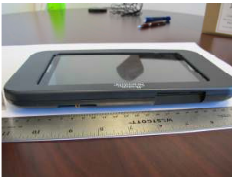
Figure 4 Model 3200 Programmer - Right View