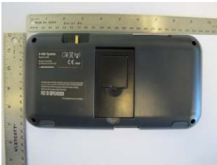
Figure 2 Model 3200 Programmer - Back View (for reference only)

Note: The labels shown are prototypes only. Label information is shown in the ID Label and Location Exhibit.