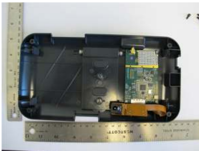
Figure 8 Model 3200 Programmer – Internal (Bottom)