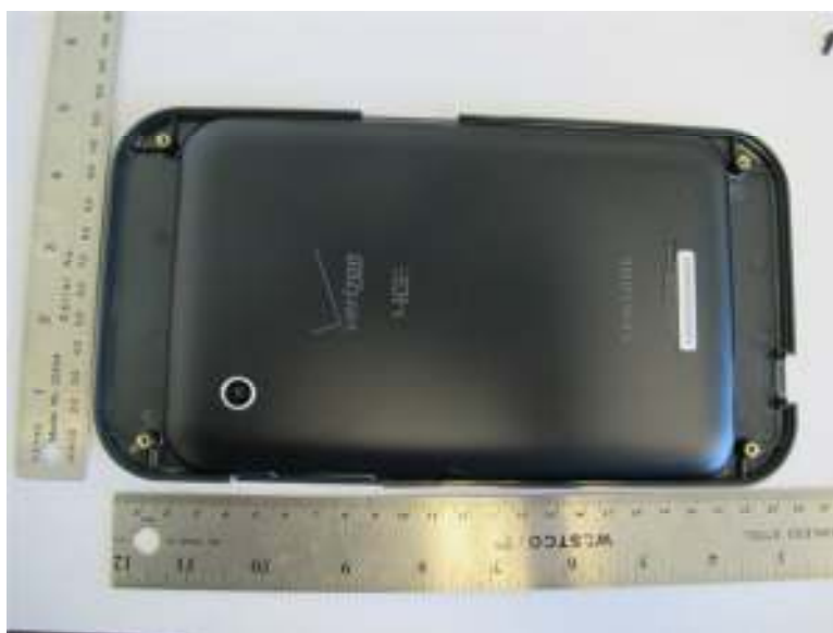
Figure 7 Model 3200 Programmer – Internal (Top)