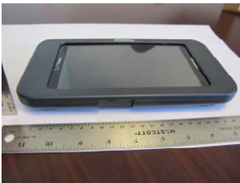
Figure 3 Model 3200 Programmer - Left View