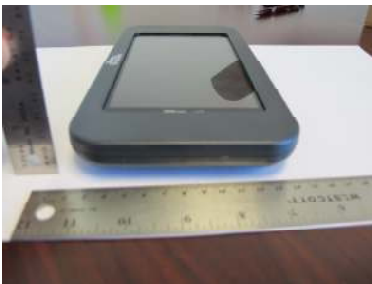
Figure 5 Model 3200 Programmer - Top View