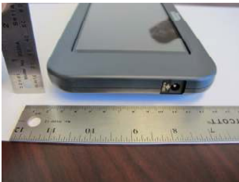
Figure 6 Model 3200 Programmer - Bottom View