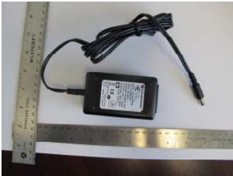
Figure 10 Model 3200 Programmer – Power Adapter (bottom)