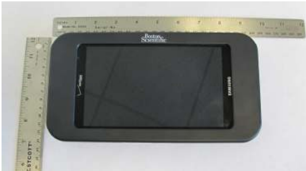
Figure 1 Model 3200 Programmer - Front View