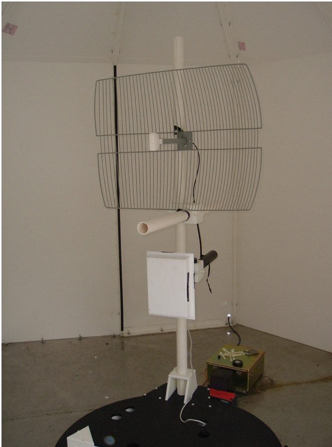
TR-6000 with 24 dBi grid