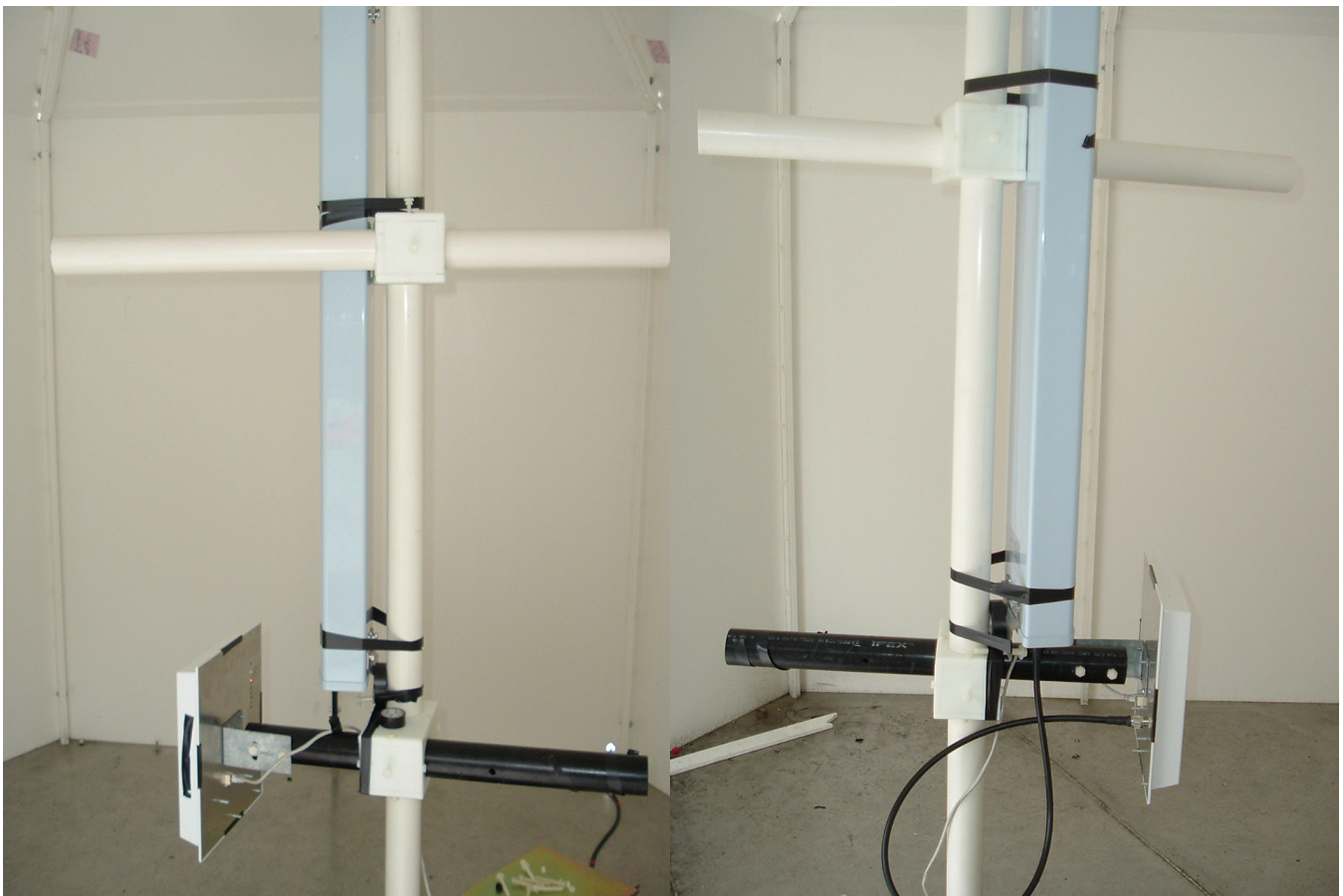
TR-6000 with 17 dBi sector