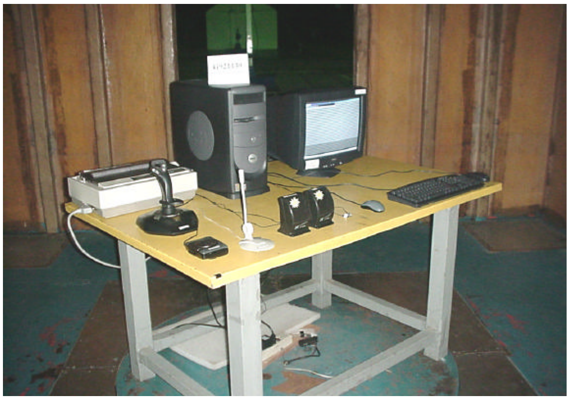
SETUP WITH MAXIMUM DETECTED EMISSION AT HORIZONTAL POLARIZATION