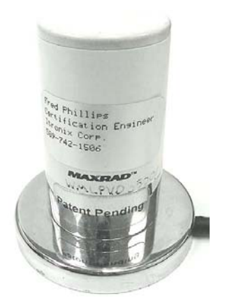
MaxRad 3 dBi Gain Vehicle-Mount Antenna P/N: WMLPVDB800/1900