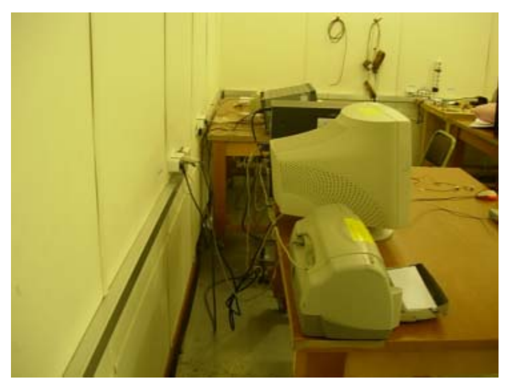
< REAR PHOTOGRAPH OF CONTINUOUS DISTURBANCE VOLTAGE >