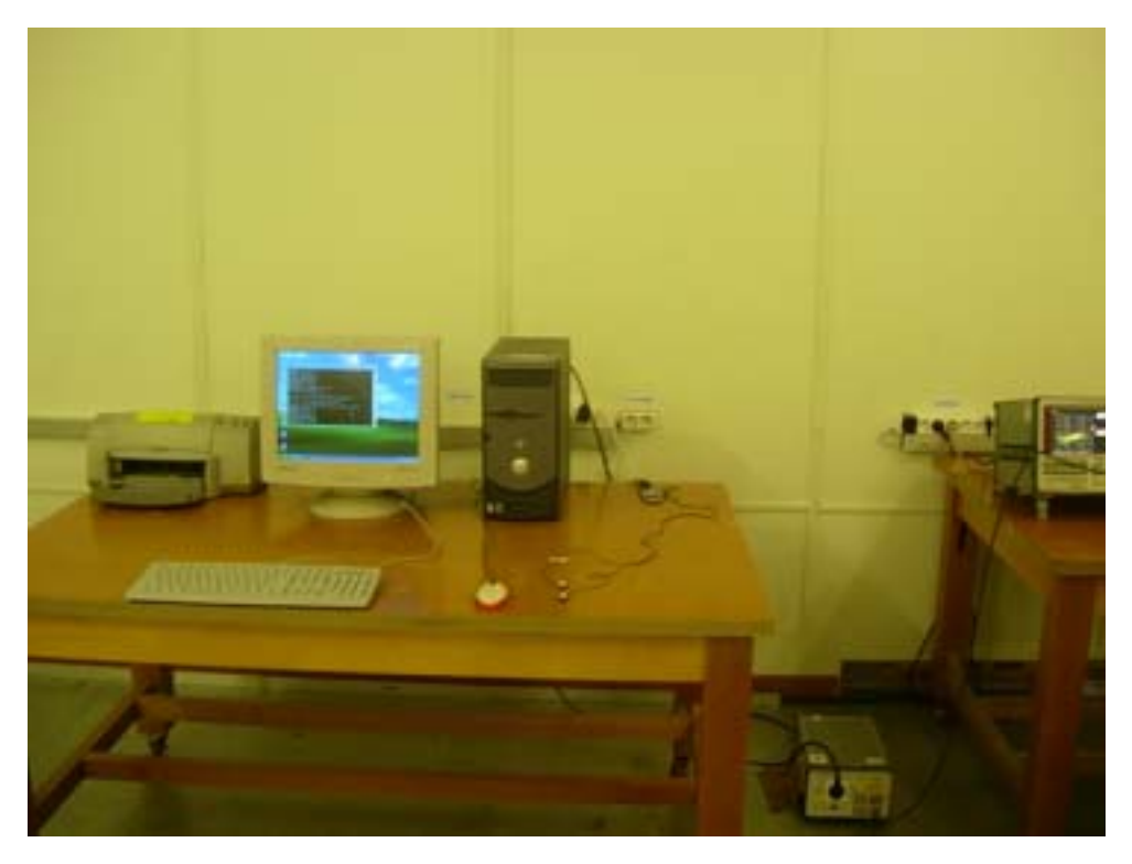
< FORNT PHOTOGRAPH OF CONTINUOUS DISTURBANCE VOLTAGE >