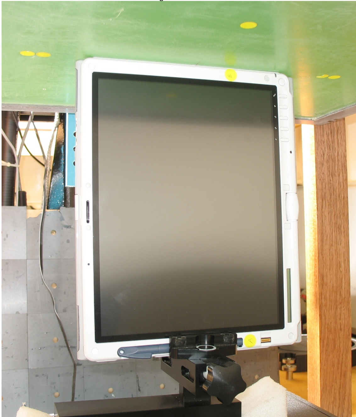
Edge On Position

This document shall not be copied or reproduced, except in full without the written permission of the Technical Director , EMC Technologies Pty. Ltd.