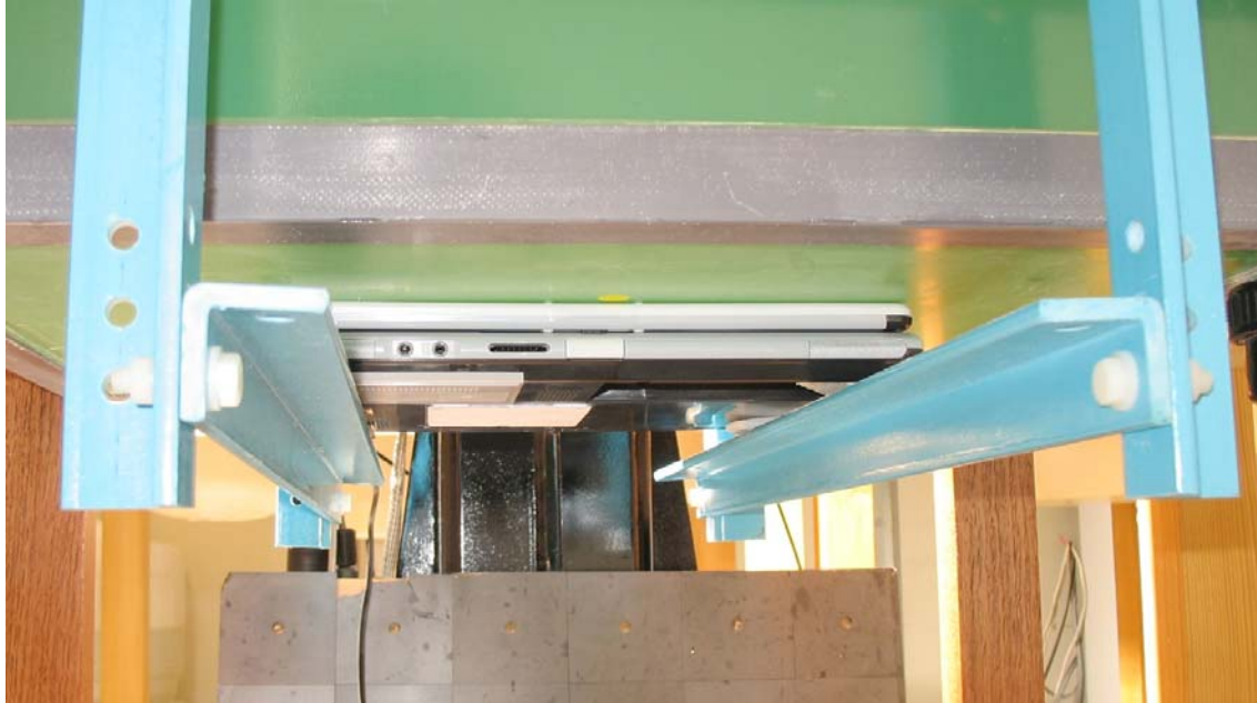
Arm Held Position