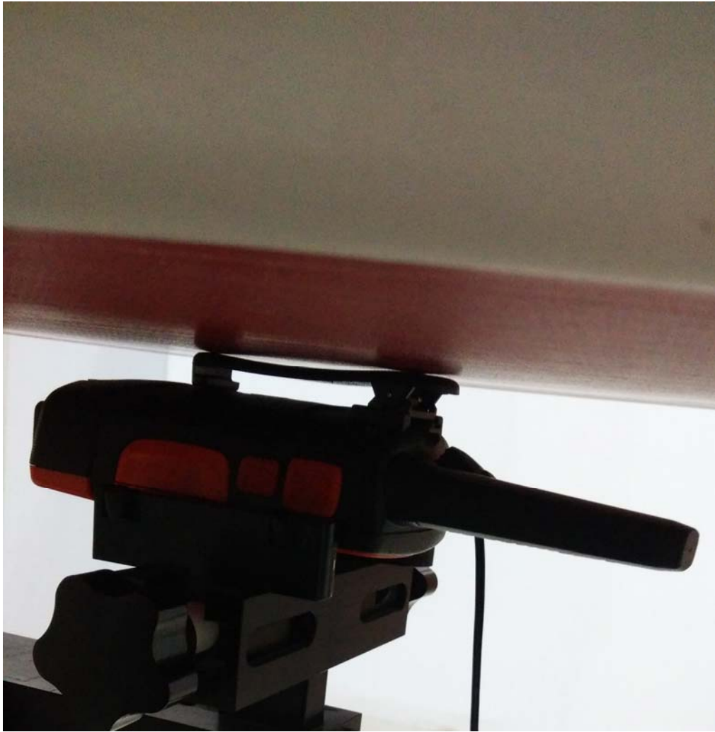
Photo of Body-worn Configuration