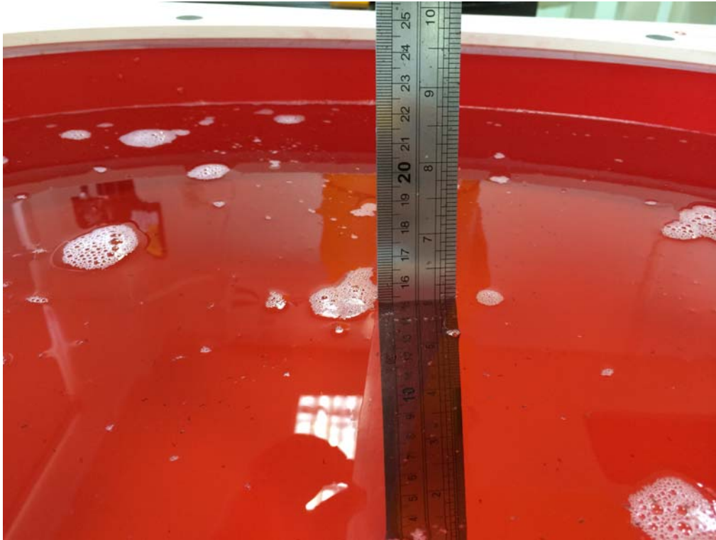
Photograph of the depth in the Head Phantom (450MHz)