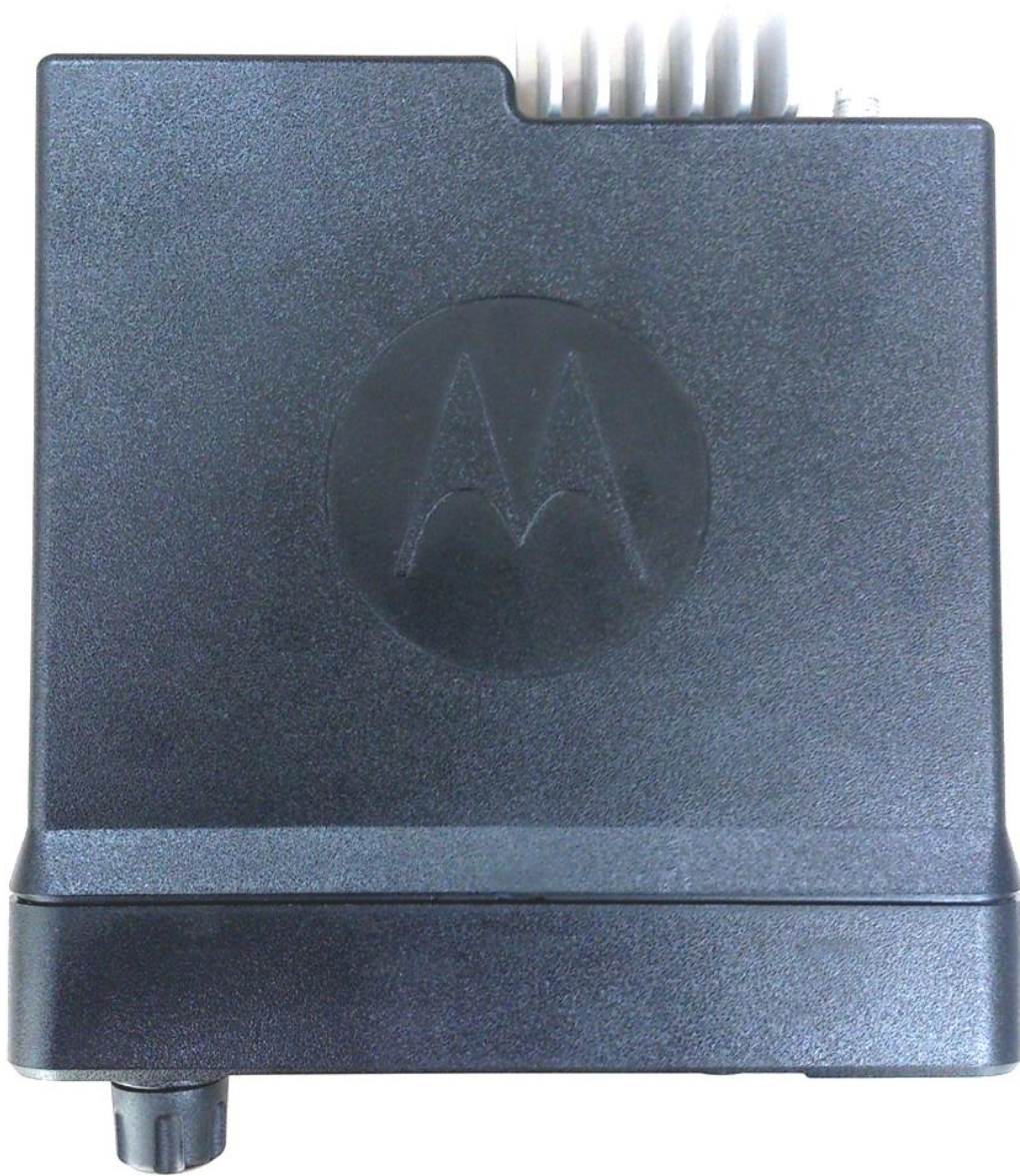
Top view for Color display and Numeric display- XPR 5550e & XPR 5350e