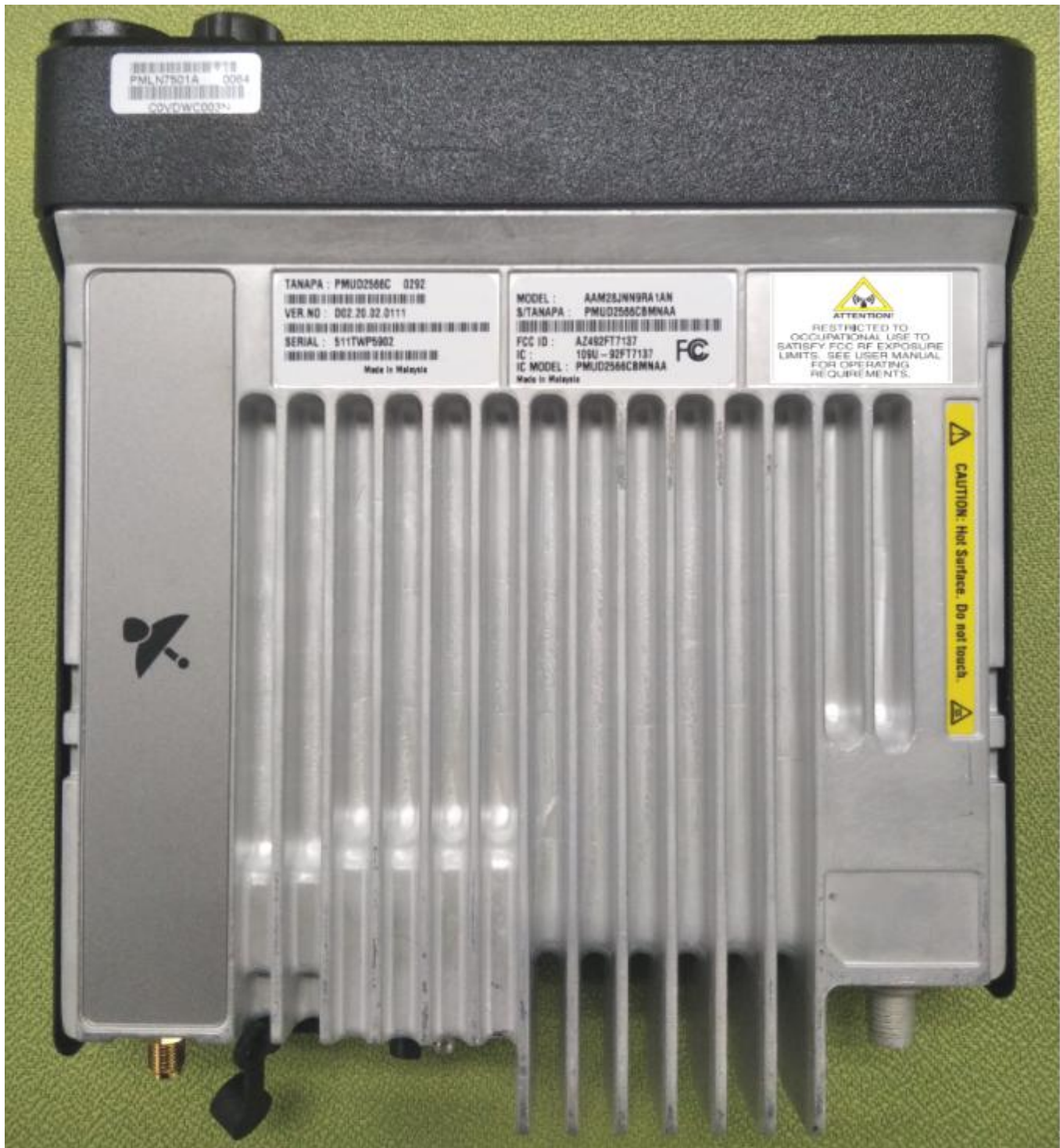
Bottom view (FCC Label Location) for Color display and Numeric display- XPR 5550e & XPR 5350e