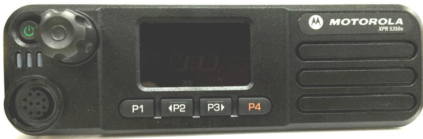
XPR 5350e Front view (Numeric display)