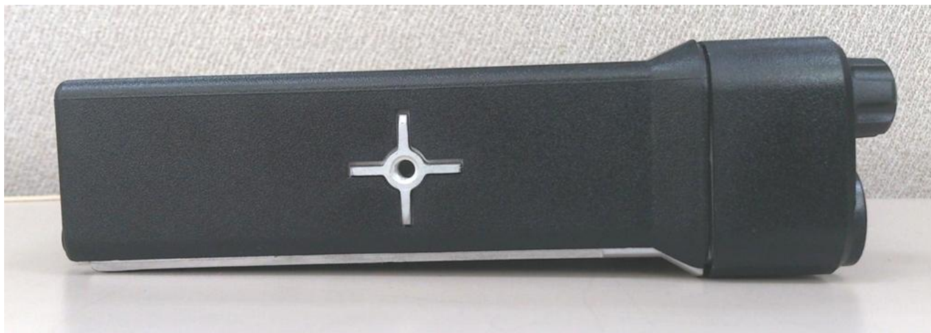
Side view (Left) for Color display and Numeric display- XPR 5550e & XPR 5350e