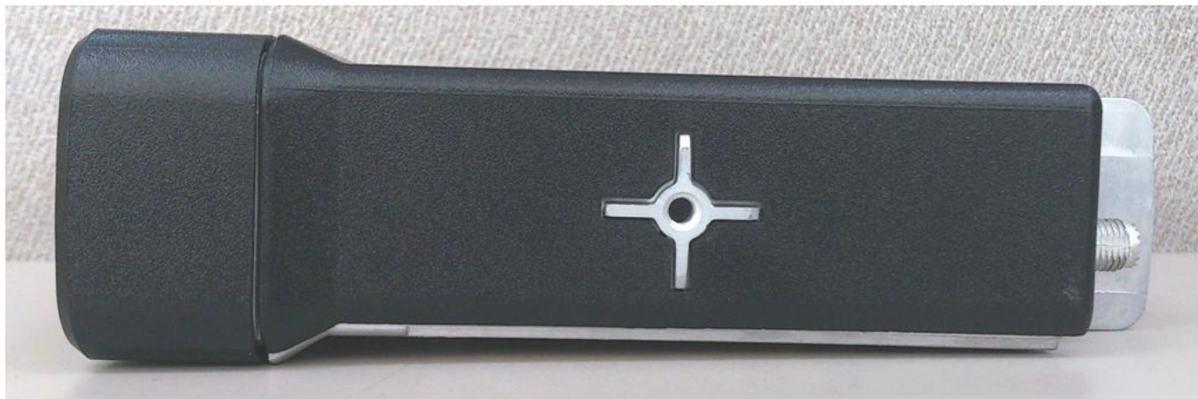
Side view (Right) for Color display and Numeric display- XPR 5550e & XPR 5350e