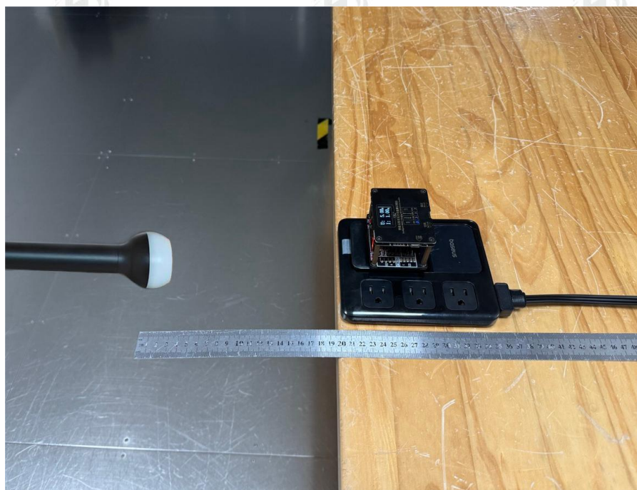
Test Set-up Photo