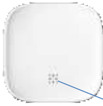
Buzzer sound hole