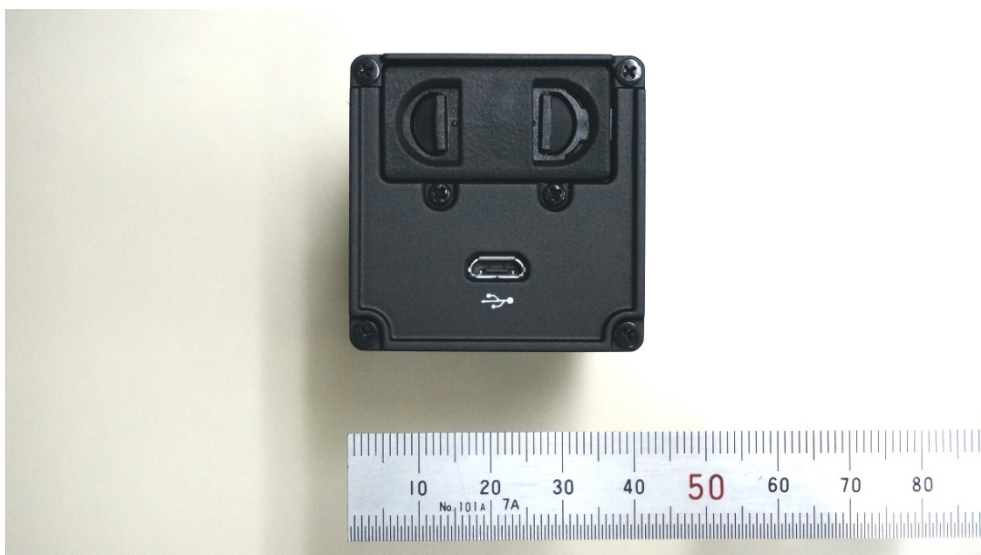
Fig.5: Bottom view