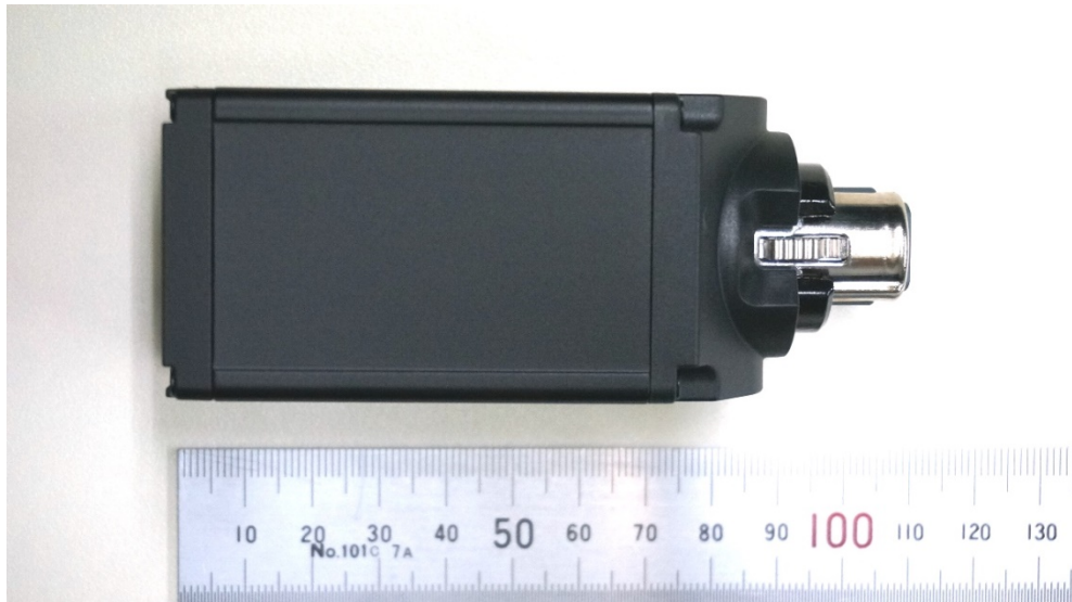
Fig.2: Rear view