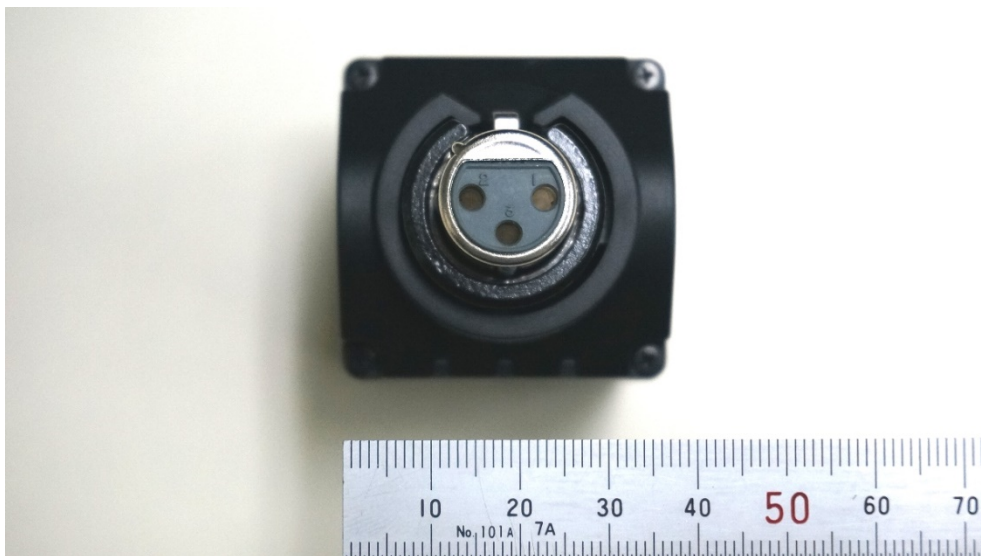
Fig.5: Top view