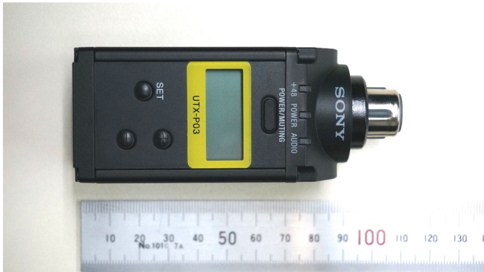
Fig.1: Front view