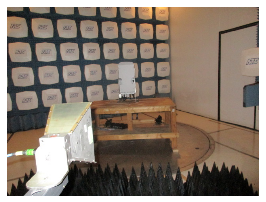
RE – 1-10GHz at 3m