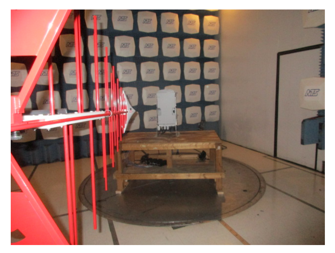
RE – 30-1000MHz at 3m