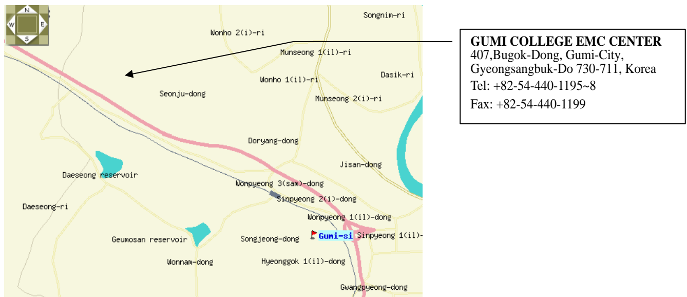
Fig 1. The map above shows the Gumi College in vicinity area.

This test site is one of the highest point of Gumi 1 college at about 200 kilometers away from Seoul city and 40 kilometers away from Daegu city. It is located in the valley surrounded by mountains in all directions where ambient radio signal conditions are quiet and a favorable area to measure the radio frequency interference on open field test site for the computing and ISM devices manufactures. The detailed description of the measurement facility was found to be in compliance with the requirements of §2.948 according to ANSI C63.4 on October 19, 1992