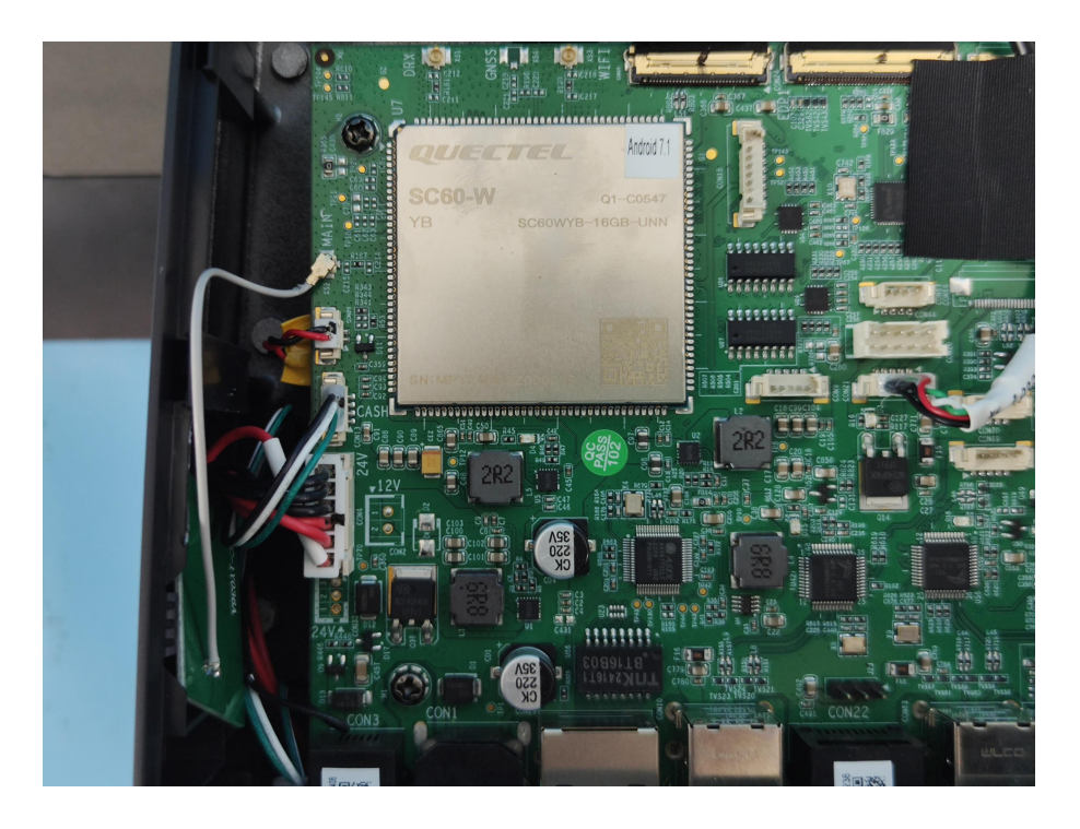
INTERNAL PHOTO OF SAMPLE PCB