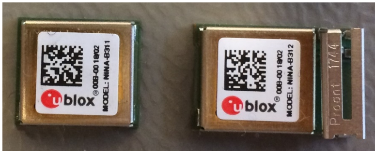
Figure 1: Label location of NINA-B311 and NINA-B312