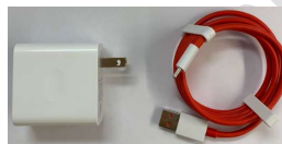
1 X ONE PLUS 7T POWER ADAPTOR