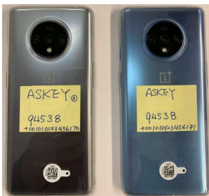
2 X ONE PLUS 7T CELL PHONE