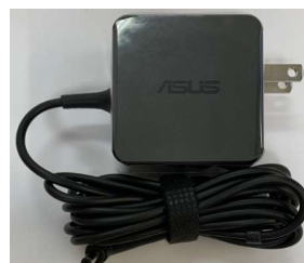
1 X ASUS LTE ROUTER POWER ADAPTOR

NOTICE: ASUS LTE ROUTER IS OPTIONAL FOR THE CBSD SMALLCELL DEMO SETUP. IT IS STRONGLY RECOMMENDED TO HAVE CONNECTION TO INTERNET VIA ETHERNET WHERE IPSEC PASSTHROUGH IS ENABLED , I.E. PORT 500, PORT 4500 ARE *NOT* BLOCKED BETWEEN SFE3160S CBSD SAMMCELL WAN PORT AND THE INTERNET.