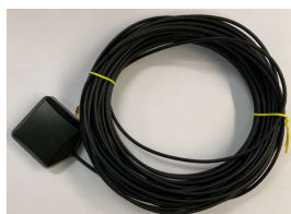
1 X GPS ANTENNA WITH LONG CABEL

NOTICE: GPS ANTENNA IS OPTIONAL IN THIS DEMONSTRATION WHERE GPS LOCATION HAS BEEN PRESET ON THE SMALLCELL FOR TESTING PURPOSE.