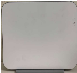
2 X SFE3160S CBSD SmallCell