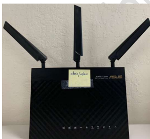
1 X ASUS LTE ROUTER