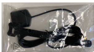
2 X GPS ANTENNA