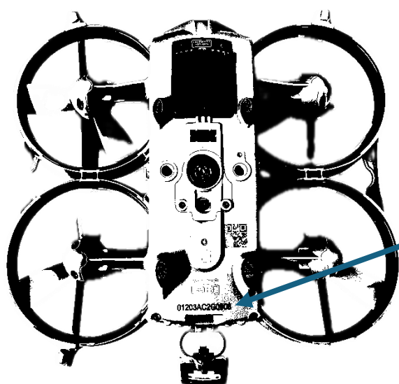
Photo: Loki MkII serial number