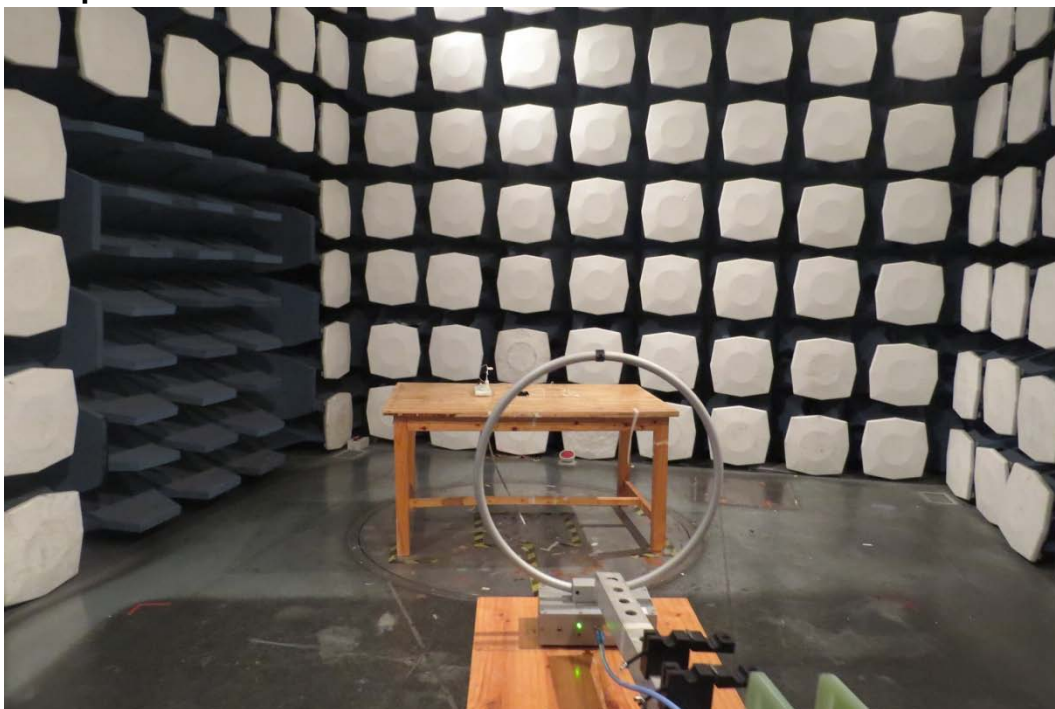
9KHz ~ 30MHz