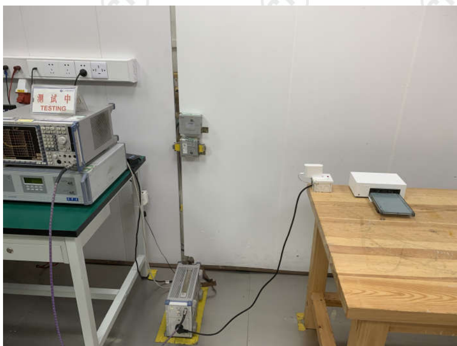
AC Power Line Conducted Emission