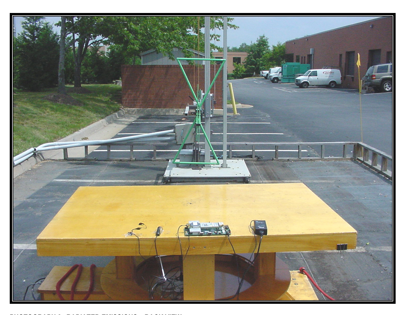
PHOTOGRAPH 2: RADIATED EMISSIONS - BACK VIEW

Client: Sony Ericsson Mobile Communications Model: CM-42 Standards: FCC Part 22, 24/IC RSS-129 Report Number: 2004060 R0.00 Date: June 30, 2004