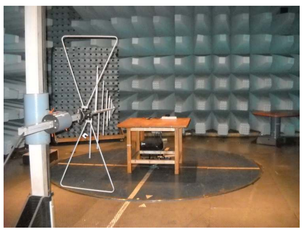
Figure 0-2: Radiated emission test below 1 GHz