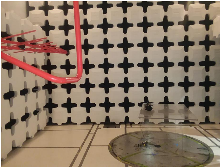
Figure 4: Radiated Emissions Setup, 30-1000 MHz