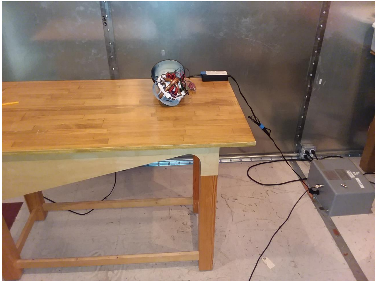
Figure 1: Conducted Emissions, Setup photo