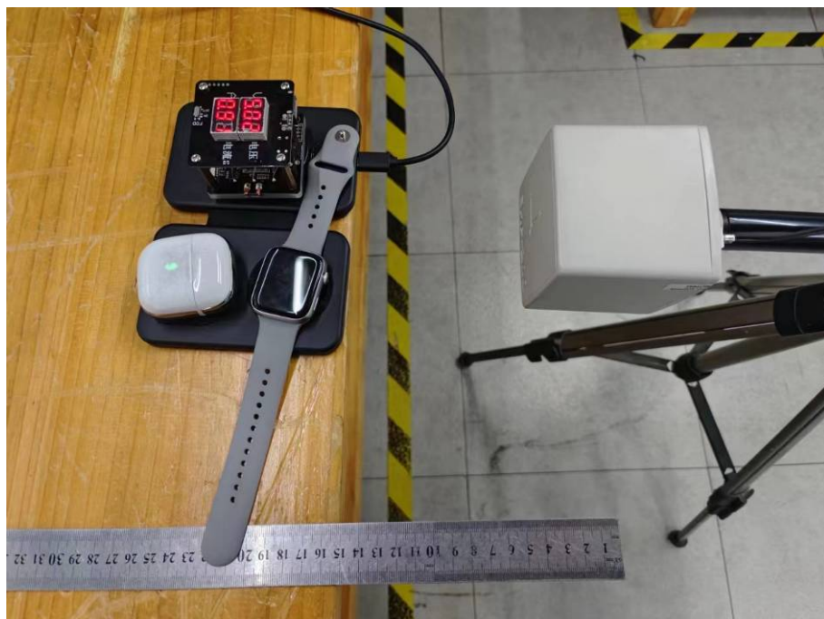
Test Position D-15cm from the edge of EUT to the geometric center of the probe