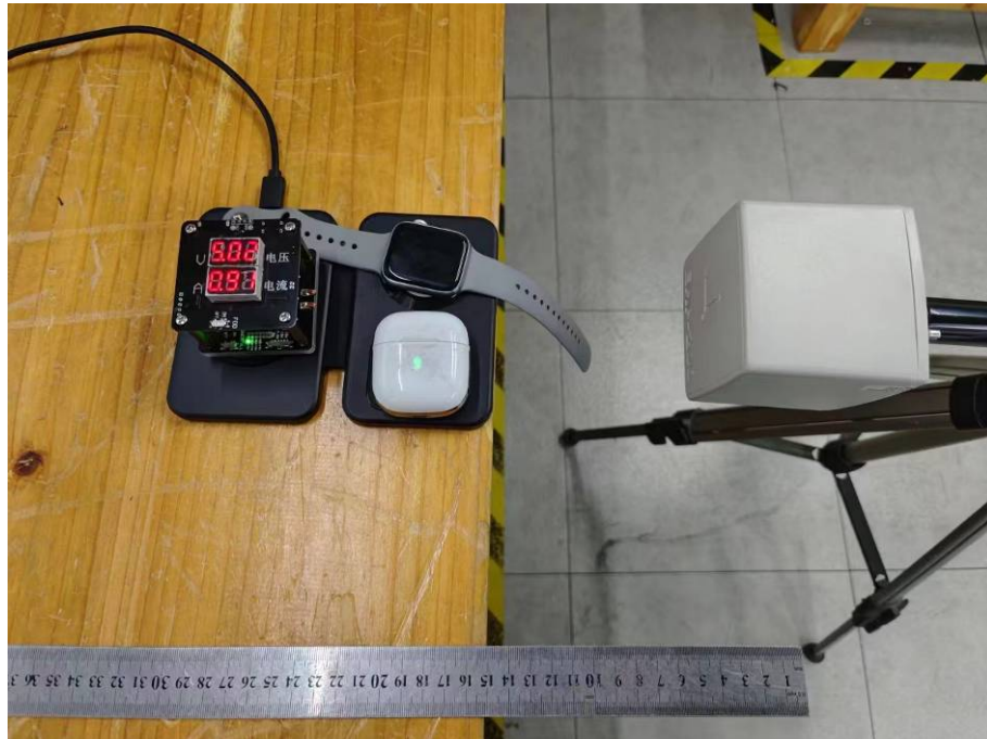
Test Position C-15cm from the edge of EUT to the geometric center of the probe