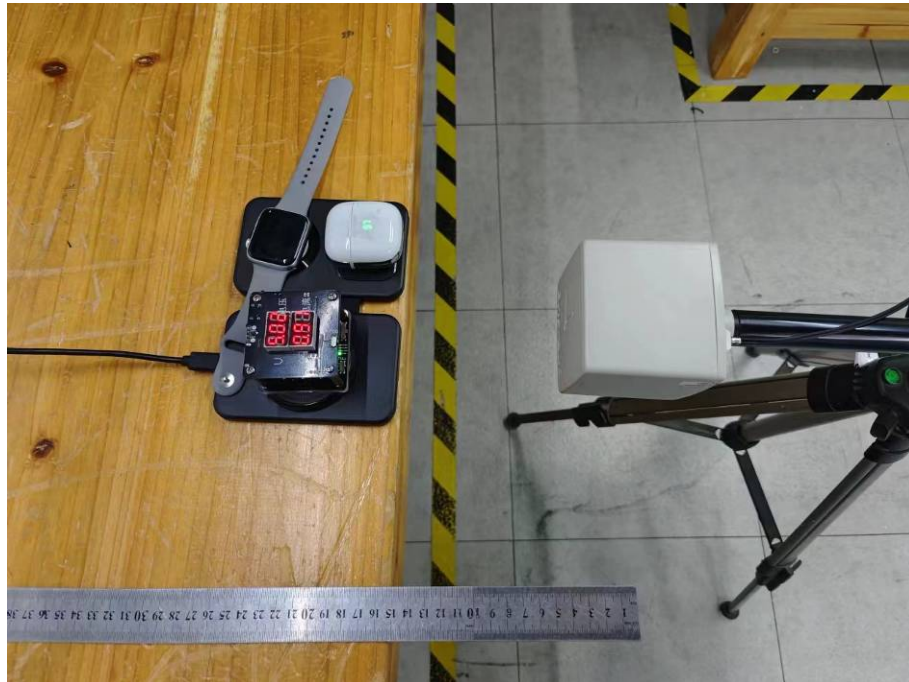
Test Position A-15cm from the edge of EUT to the geometric center of the probe