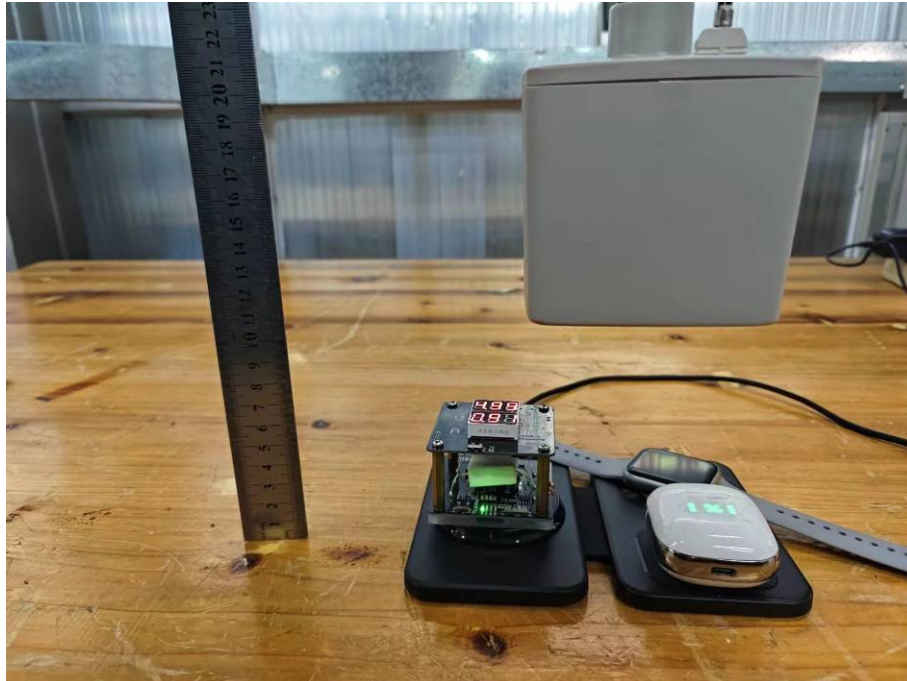
Test Position E-15cm from the edge of EUT to the geometric center of the probe