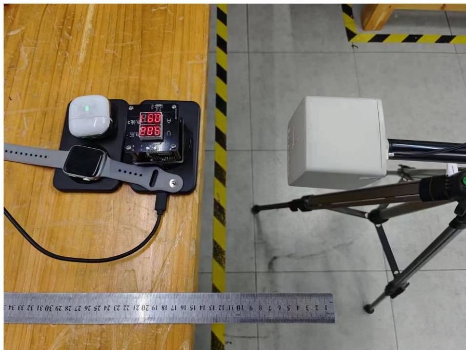
Test Position B-15cm from the edge of EUT to the geometric center of the probe