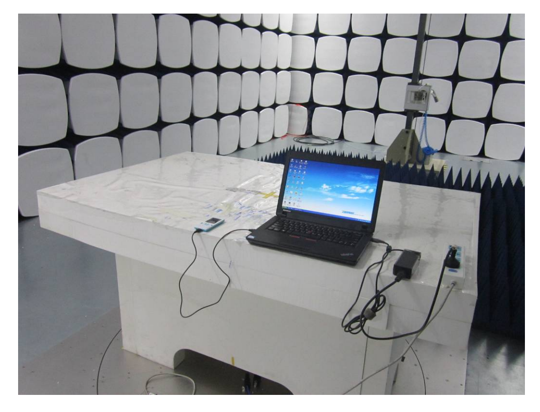
Radiated Spurious Emissions Test Setup Above 1GHz -Front View