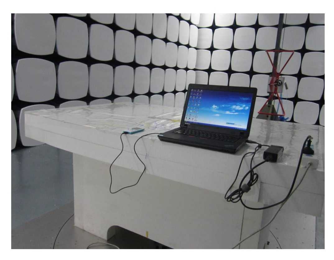
Radiated Spurious Emissions Test Setup Below 1GHz - Front View

Report No.: 14070216-FCC-E1 Issue Date: May 22, 2014 Page: 30 of 36 www.siemic.com www.sinmic.com.cn