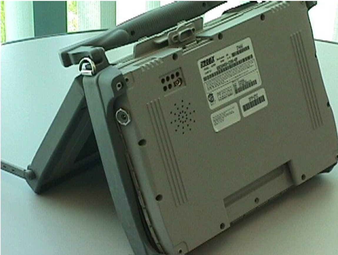
Figure 2: Location of the FCC Approval label