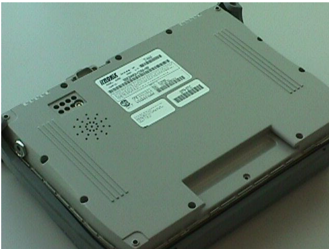
Figure 1: Location of the FCC Approval label