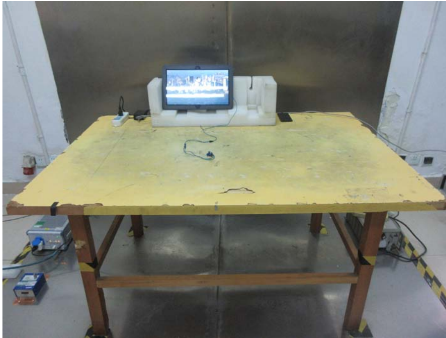
Conducted Emission Rear View