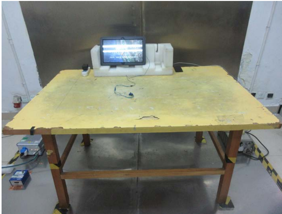
Conducted Emission Rear View