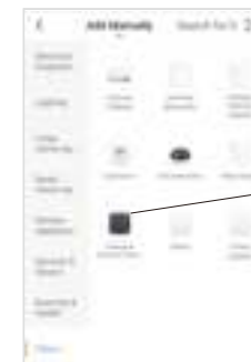
Universal remote control

● Open Tuya Smart App, click "My Home", click "+" in the upper right corner, and select "Universal Remote Control" in the "Other" directory. :