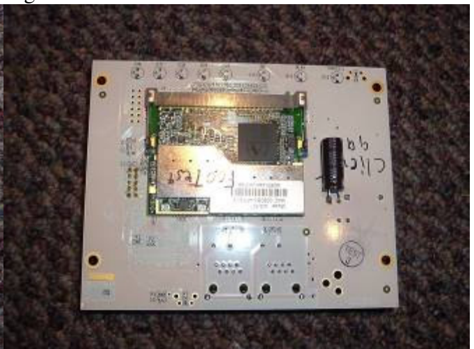
Figure 6 – Carrier Card and Radio