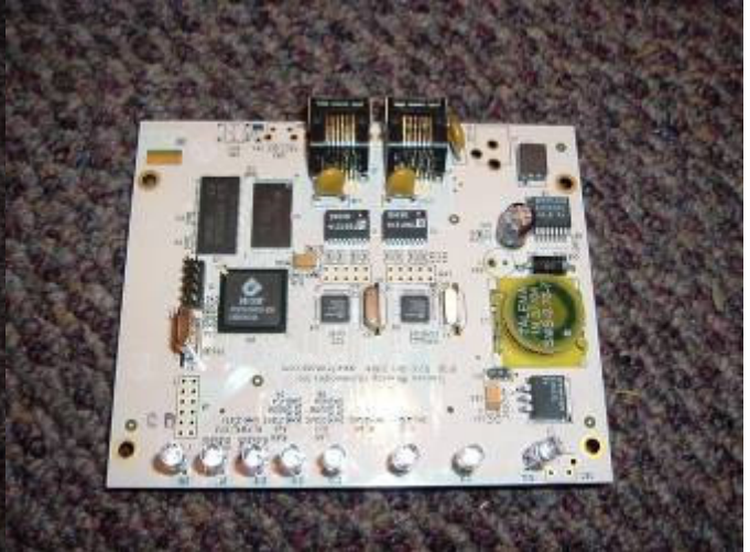
Figure 2 – Carrier card reverse