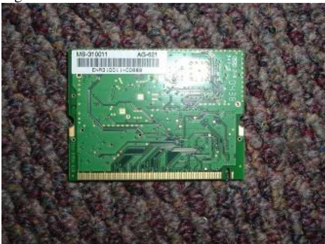
Figure 5 – Radio card reverse