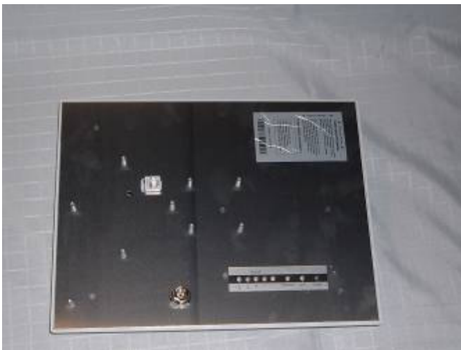
Figure 7 – Backplate reverse (ext of unit)