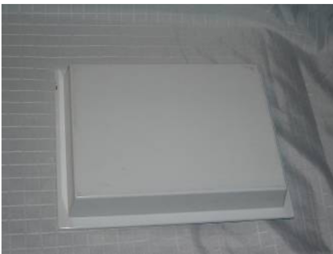
Figure 11 – TR-AP5A-N front cover installed