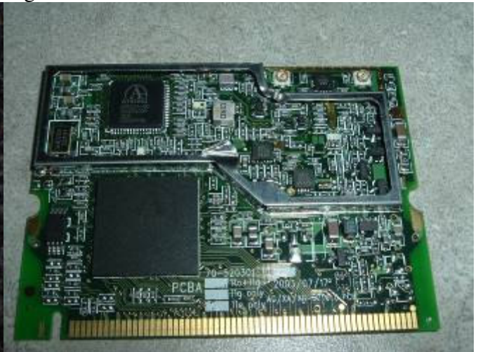
Figure 4 – Radio card without rf shield