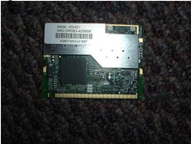
Figure 3 – Radio card