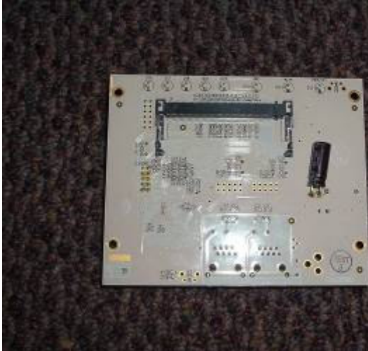
Figure 1 – Carrier card