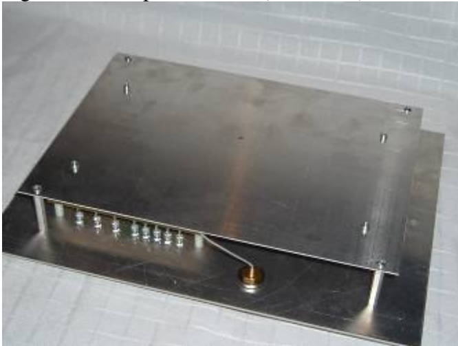
Figure 9 – Structure plate installed